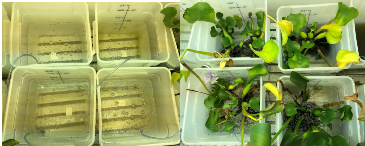
Figure 2: Experimental set-up of the containers, with the controls on the left and the environmental factor (water hyacinth) on the right, with air supply connected.

weeks by emptying out the water and cleaning away remaining algae growth and salt buildup as well as completely replacing HHCOMBO media.