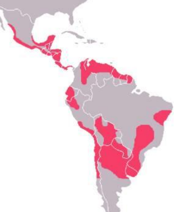
Figure 2. Endemic Areas of Chagas

countries, the prevalence of ChD has risen in