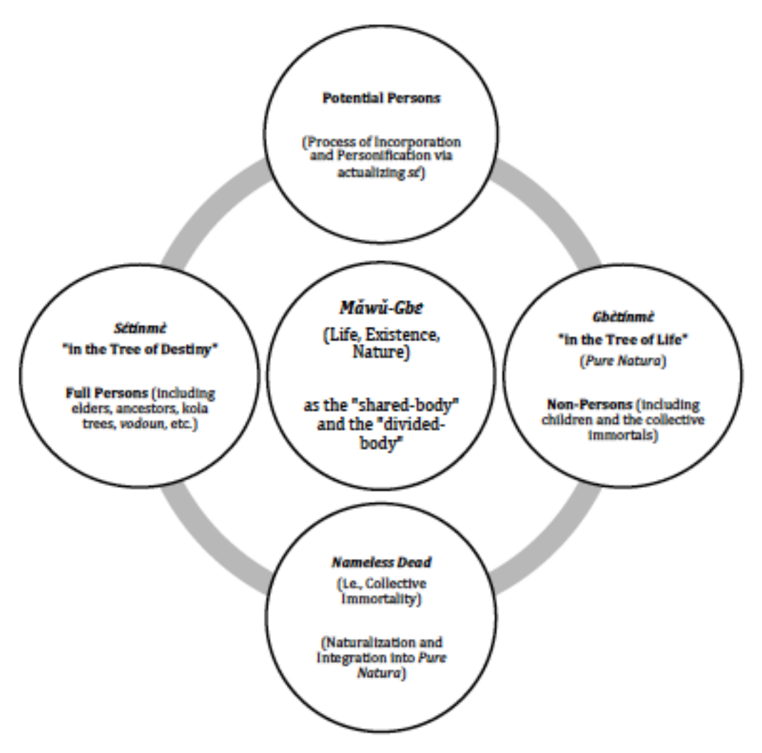
Diagram 2. The Ontological Progression of Persons and Community in the Mawu-Gbe Communitarian Cosmos

and recalling my argument in chapter four, I conclude that this metaphysical progression maps (see the diagram below) the process by which beings emerge from the pure natura of gb\grave{e} to be personified and incorporated in the world (gb\grave{e}m\grave{e}) and then are eventually, at some undetermined time, reintegrated back into pure natura , an affirmation of the fundamental nature of all beings. Likewise, I propose that this ontological progression maps the course by which gb\grave{e} beings become s\acute{e} persons, and, simultaneously, the gb\grave{e} nature community as gb\grave{e}t\acute{n}m\grave{e} , the tree of life, becomes the s\acute{e}t\acute{n}m\grave{e} , the tree of destiny.