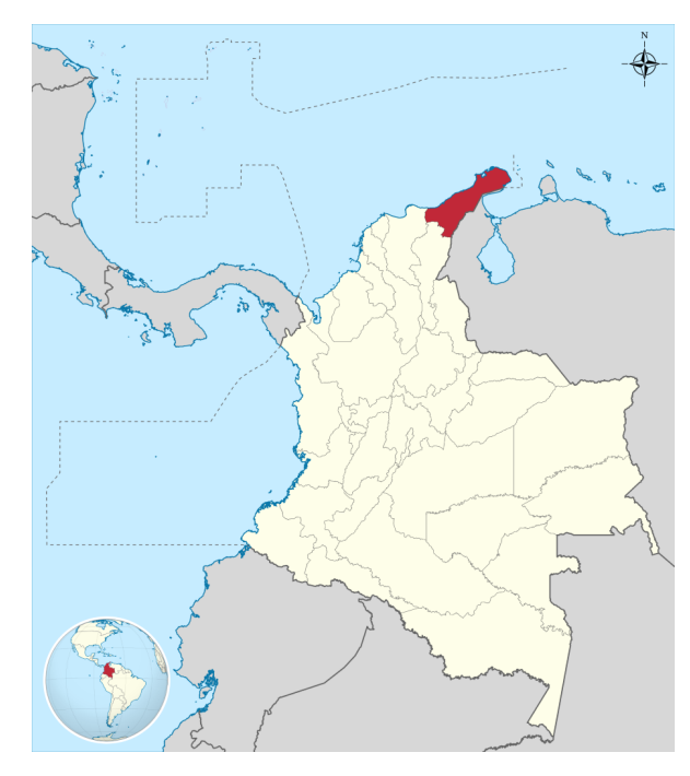
Figure 1. Department of La Guajira in Colombia.

department is located in the northeastern region of the country. It is a peninsula that borders Venezuela in the southeast and surrounded by the Caribbean Sea to the north and west. The region comprises of 44.9% indigenous and 14.8% Afro-Colombians (DANE, 2005). Ninety percent of the dispersed population in the region cannot meet their basic needs (World Food Programme, 2017). Approximately 60% of