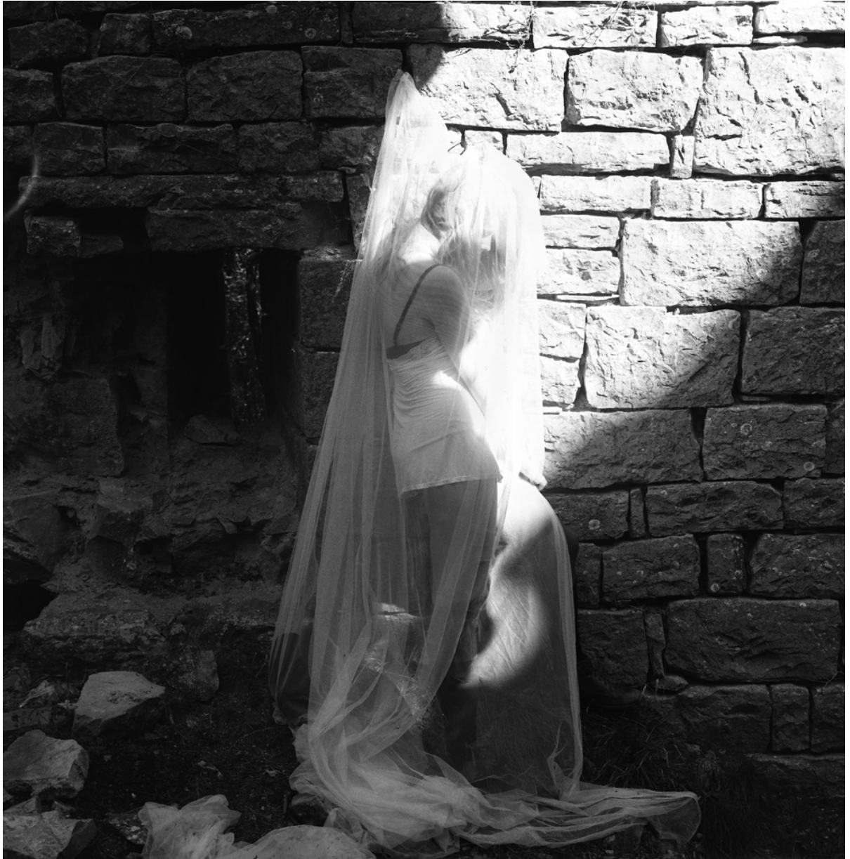
Tired , Watts, Silver Gelatin Print, 2012, 11 x 11 inches