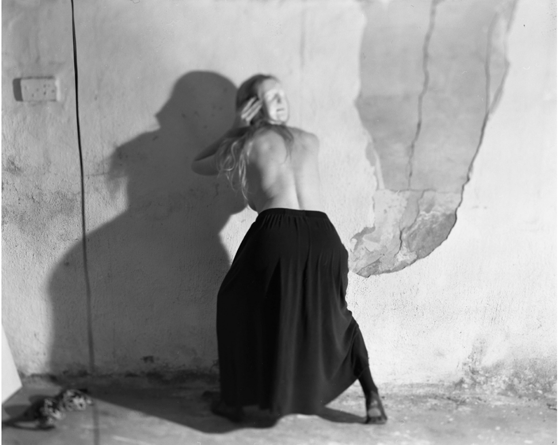
Dissimulation , Watts, Silver Gelatin Print, 2012, 11 x 14 inches