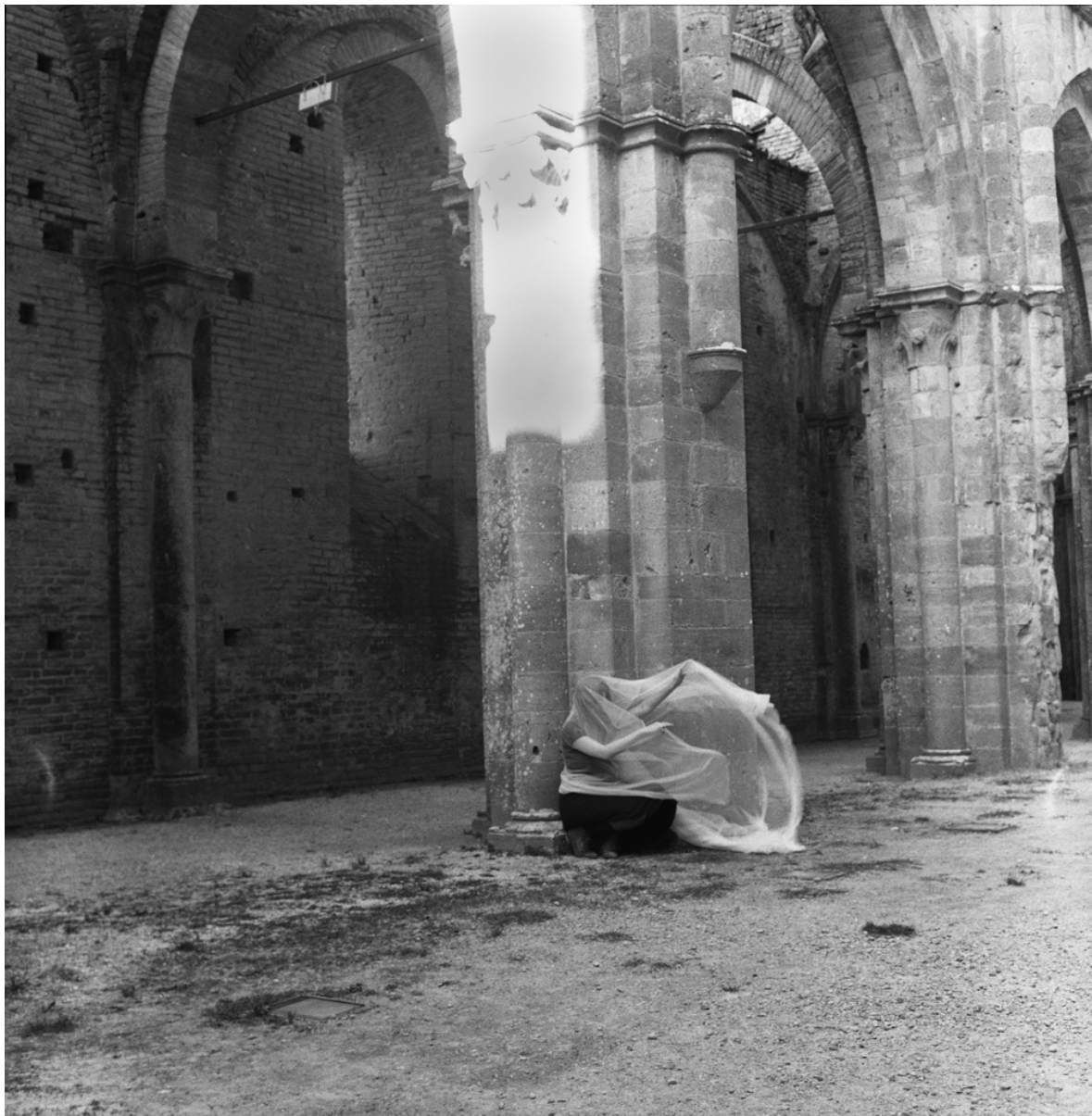
San Galgano 25 , Watts, Silver Gelatin Print, 2012, 11 x 11 inches