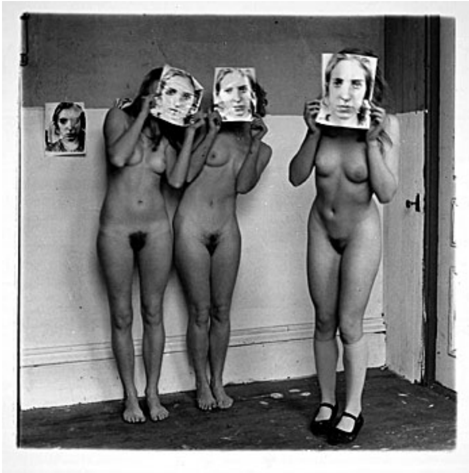
Untitled, Providence, Rhode Island, 1975-78

photographs are undeniably about performance and process.