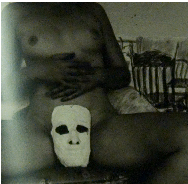
Untitled, Woodman, Providence, Rhode Island, 1976