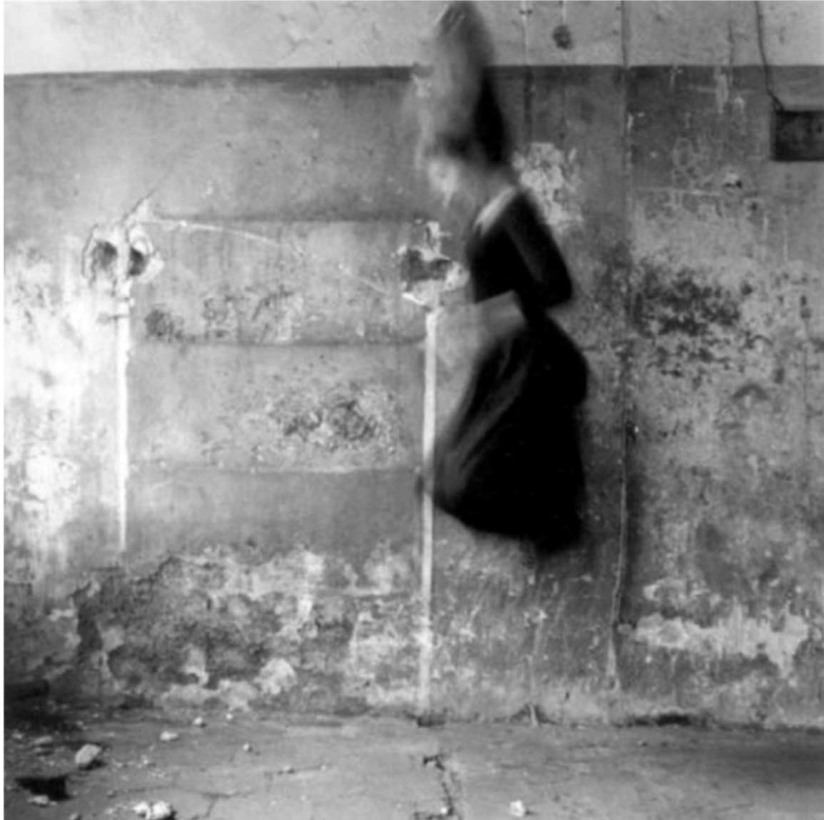
Untitled, Woodman, Rome, Italy, 1979