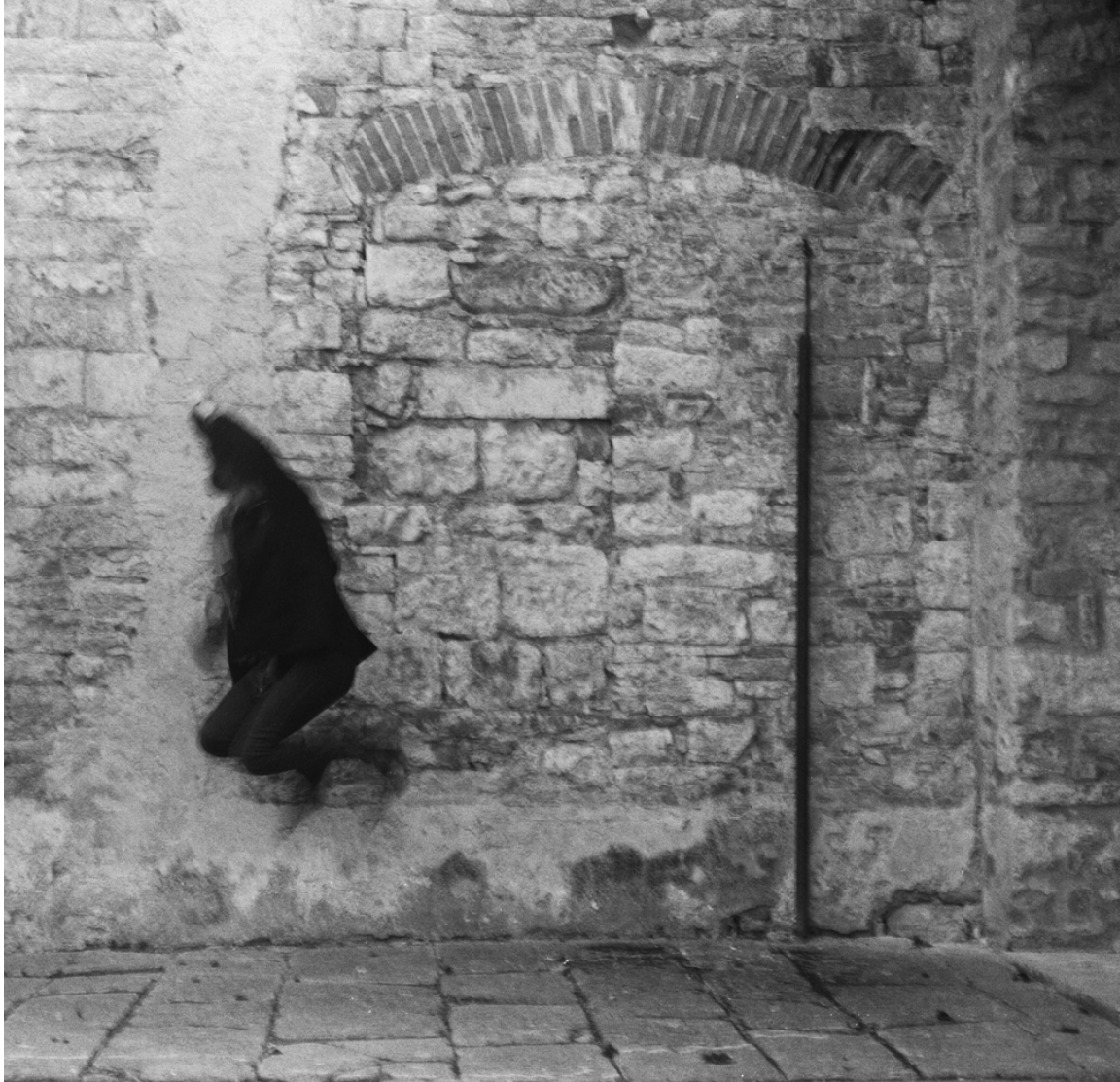
Sister Flight , Watts, Silver Gelatin Print, 2012, 11 x 11 inches