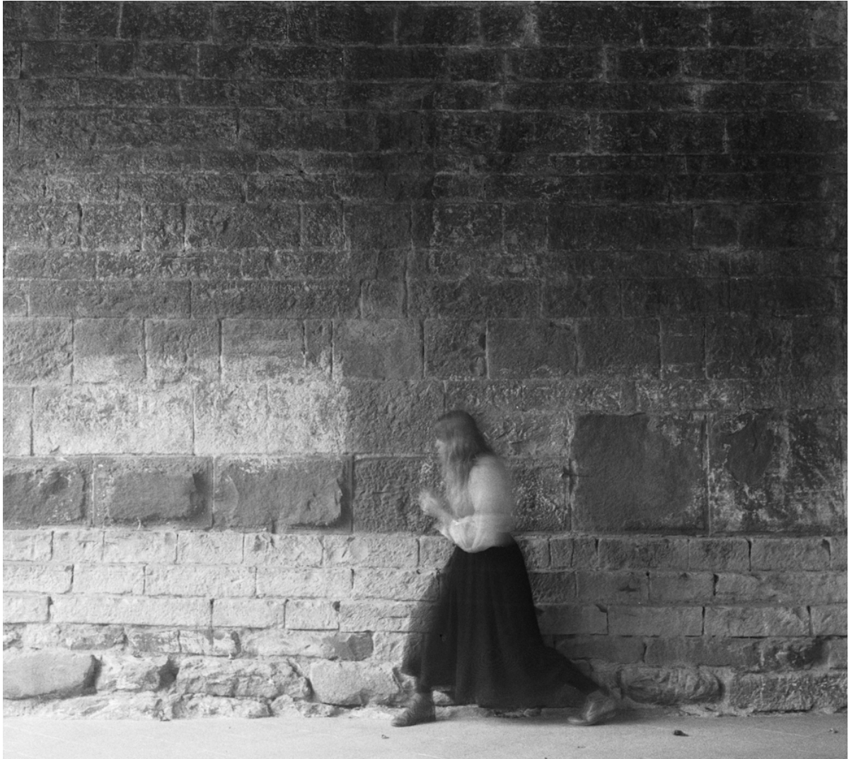
Fictitious Fixation , Watts, Silver Gelatin Print, 2012, 11 x 11 inches