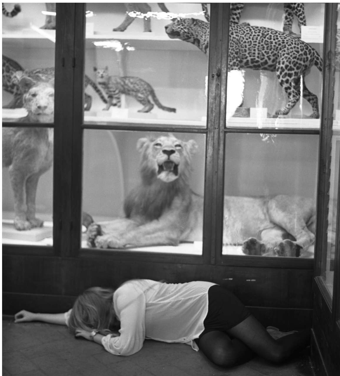
Napping in La Specola, Watts, Silver Gelatin Print, 2012, 11 x 11 inches