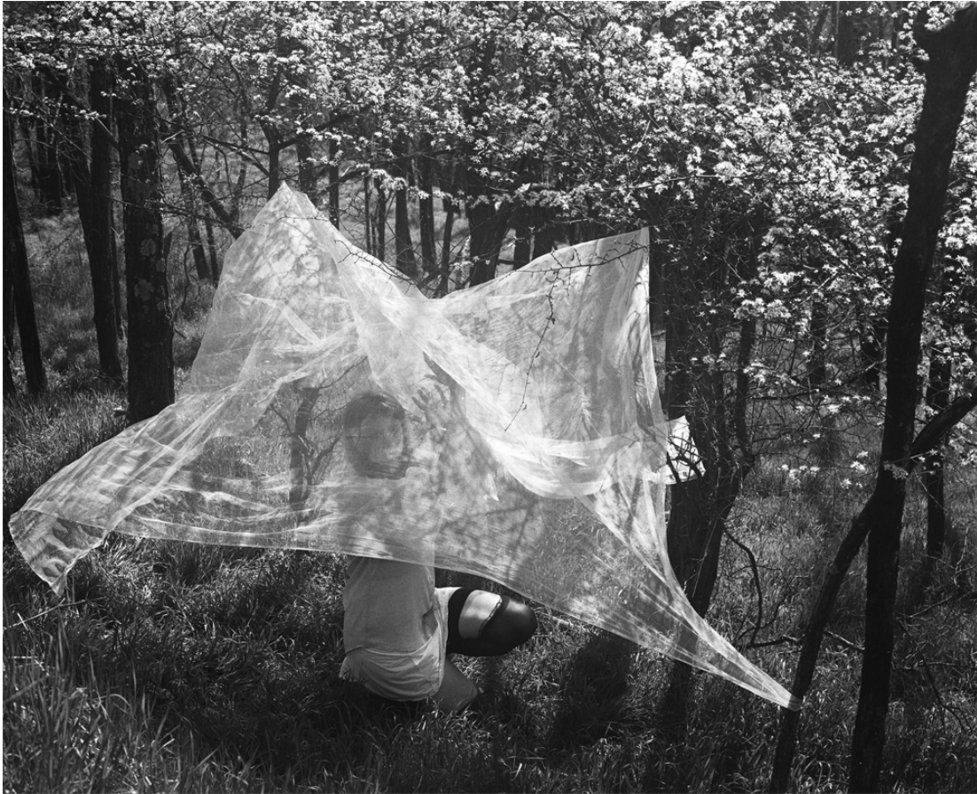
Mother, son, Watts, Silver Gelatin Print, 2012, 11 x 11 inches