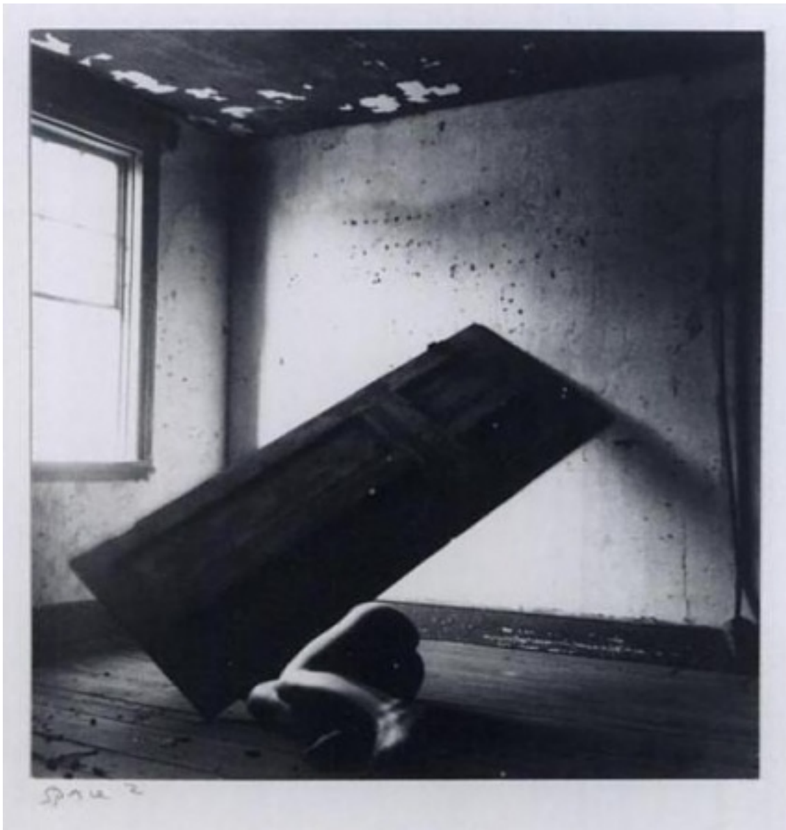
Space2, Providence, Rhode Island, 1976

instead turned to Pictorialism of photographic practices of the early twentieth century. Instead of the cold dry lens of the Bechers and so many other conceptual artists at this time, Woodman rendered her figures and forms in a painterly fashion. Rather than delineating her subject matter in hard crisp definition, Woodman preferred the play between definite and elusive forms. For example, flesh often dissolves and becomes indistinguishable from its surroundings.