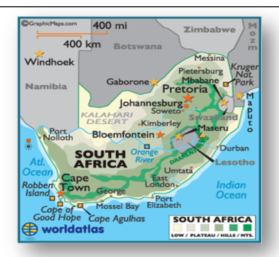
Figure 1: Map of South Africa.

continent, just south of Namibia, Zimbabwe and Botswana. The country spans 1.2 million square miles and is nearly twice the size of Texas. It has nine provinces and its capital, Pretoria, is located in the Gauteng province in the northeastern part of the country. South Africa has the most advanced economy in Africa, with a Gross Domestic Product ranked 26<sup>th</sup> in the world and $505.3 billion in assets reported in 2009 (CIA, 2010; Republic of South Africa, 2009). It is a middle-income, emerging market with an abundant supply of natural resources. It relies heavily on its mining industry, and is the world's number one supplier of chromium, gold and platinum. It has a population of approximately 49 million with a median age of 24 years (CIA, 2010). The population life expectancy is about 49 years old. Most South Africans live in urban sectors (61%) and are highly literate (86.4%). South Africa has 11 official languages including isiZulu, isiXhosa, Afrikaans, Sepedi, and English. Its population is composed of four major sub-populations described in the 2001 census in the following ways: Black African (79%), White (9.6%), Coloured (8.9%), and Indian/Asian (2.5%) (CIA, 2010).