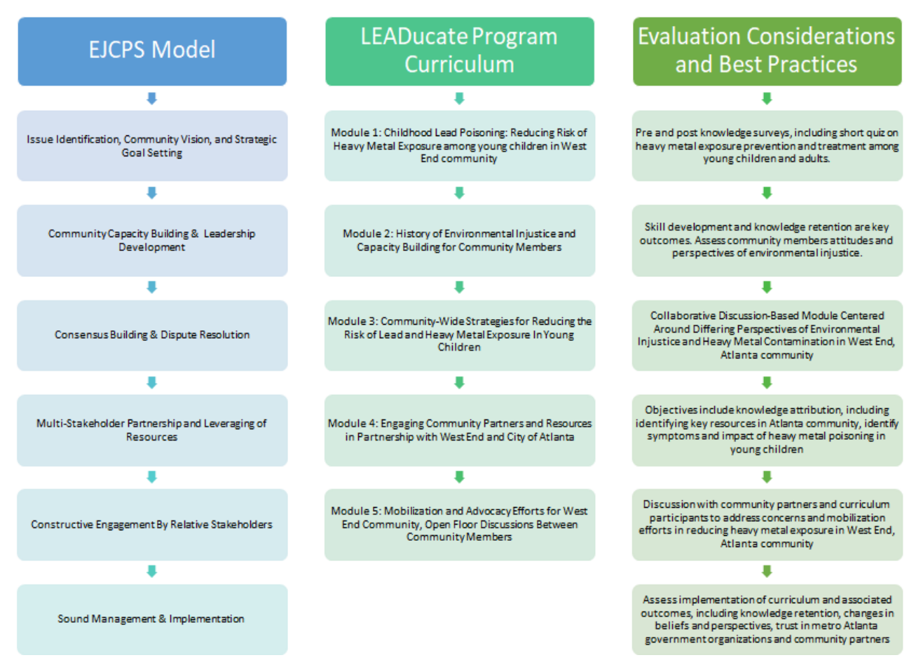
Figure 2: Curriculum Plan for LEADucate Program