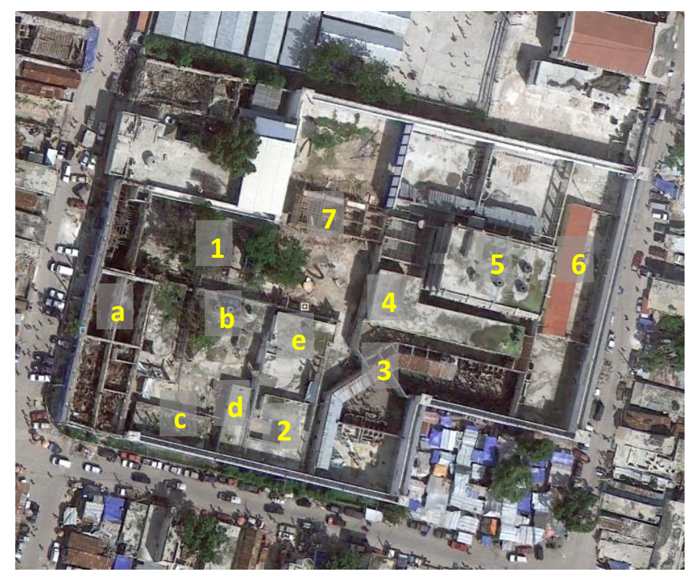
Figure 1: Aerial View of the Prison Civile with Labeled Structures