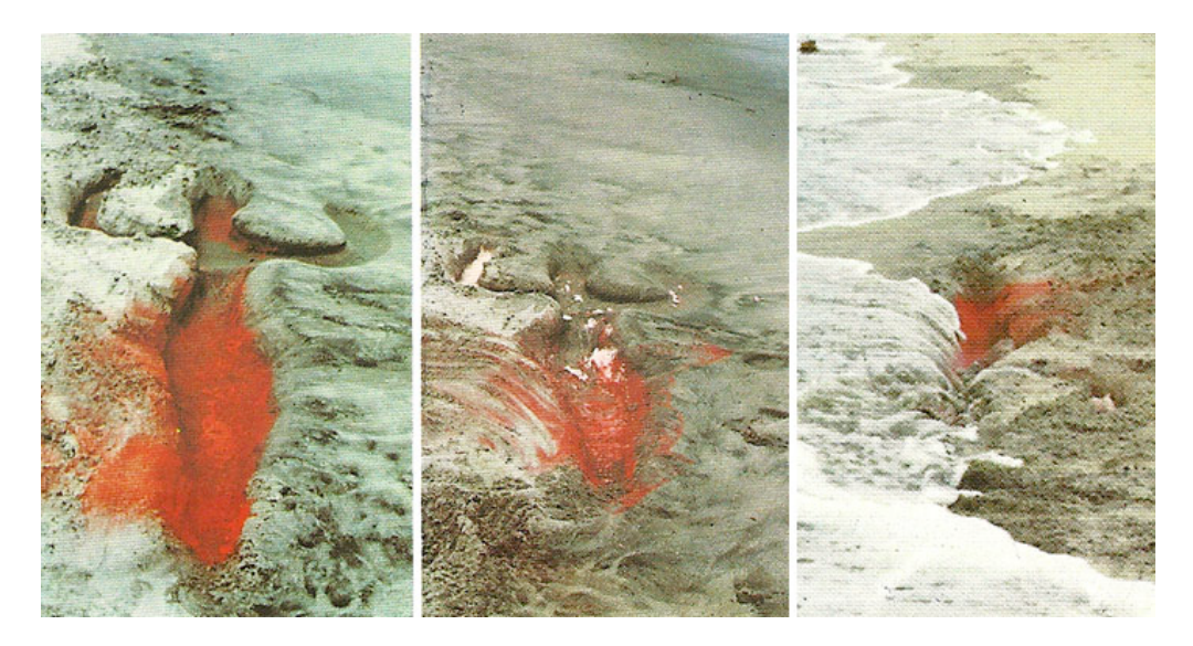
Mendieta, Ana. Untitled (Silueta Series, La Ventosa, Mexico), 35 mm color slides, 1976.