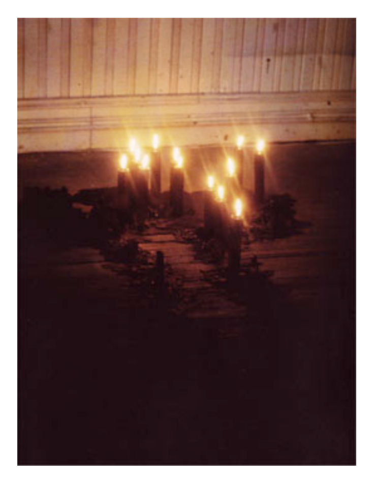
Mendieta, Ana. Ñañigo Burial , 47 black ritual candles, 1976.