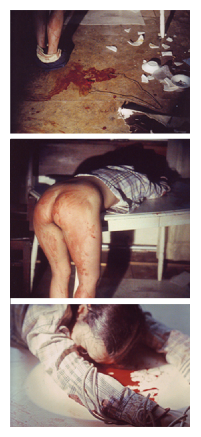
Mendieta, Ana. Untitled (Rape Scene), 35 mm color slides, 1973.