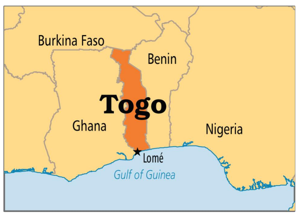
Figure 1: Map of Togo within West Africa.

One of the United Nations' Millennium Development Goals identified the target of decreasing maternal mortality by three quarters globally by the year 2015—a goal that remains largely unmet. One of the most significant barriers to reducing maternal mortality is the continued incidence of unsafe abortions, defined by the WHO as a pregnancy-ending procedure performed by an individual lacking the necessary skills, carried out in an environment that does not meet minimal medical standards, or both (WHO, 2006). Unsafe abortions, 98% of which occur in developing countries, account for 13% of maternal deaths globally and make up 49% of abortions worldwide (Ahman & Shah 2011).