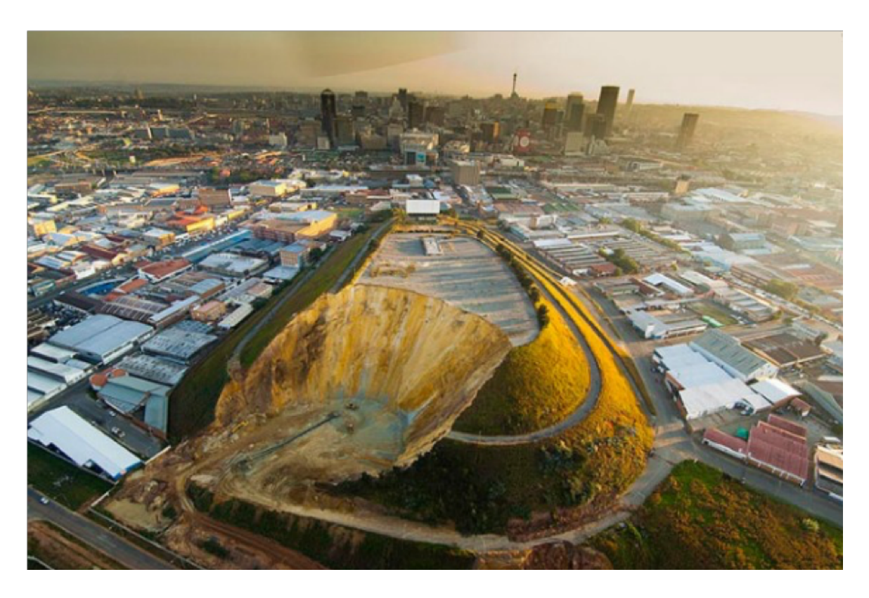
Image: Top Star Drive-in atop mine dump, Johannesburg, 2014

What is wrong with this world that it wants to waste you like that... ...my children...my Africa! Athol Fugard, 1989