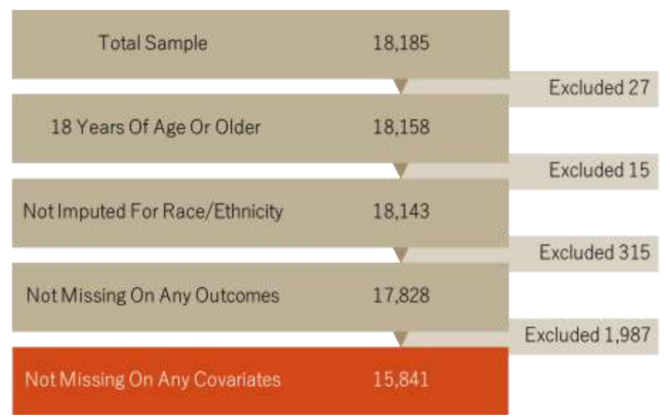
Figure 2: Derivation of the analytic sample including initial sample size and those lost to exclusion criteria. Analytic Plan

The analyses utilized weighted logistic regression models. The weights accounted for the complex survey design elements of the data and were calculated differently for state facilities than federal facilities. State facility weights included the basic weight, weighting control factor, duplication control factor, person non-interview adjustment factor, and control count ratio adjustment factor. Federal facility weights included the same factors as the state facility's final weights and also included a drug subsampling factor (74). The statistical models followed a stepwise progression that first examined the bivariate relationship between race/ethnicity and any mental health service use. The models then included predisposing characteristics, enabling characteristics, and need characteristics, in that order. Secondary analyses examined specific types of treatment utilized and followed the same step-wise pattern as the primary analysis. STATA version 16 was used for all analyses.