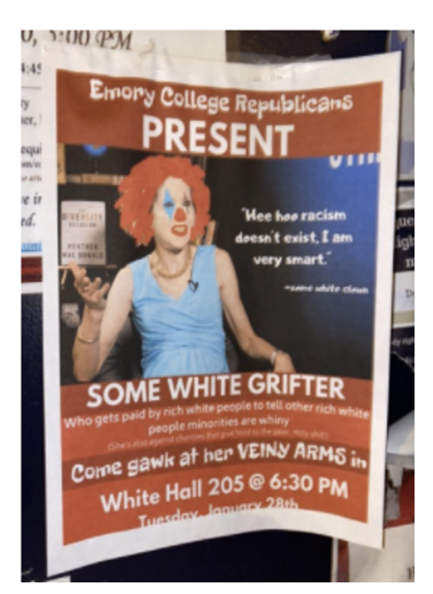
Figure 3: A student-created meme in response to Mac Donald.

Events like Mac Donald's lecture highlight the lack of support that the University provides to its students, whom they supposedly take pride in. Students were visibly upset during the event with one student even needing to leave the room, as she sobbed into the hallway. Yes, FLI students are resilient, and they will persevere, but at what cost? These students are already susceptible to imposter syndrome, as they navigate the college scene alone. To have Mac Donald