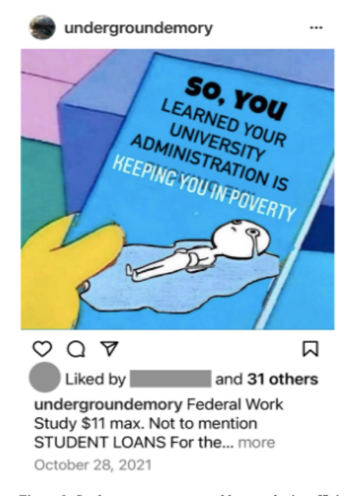
Figure 2. Student meme account addresses the insufficient standard of Federal Work-Study wage.

These policies create a system (Figure 2) where FLI students are further marginalized from accessing available healthcare resources that they pay for and contribute to the structural violence committed (Underground Emory, 2021). The broad social forces at play - classism - create violence perpetuated in healthcare at Emory that is