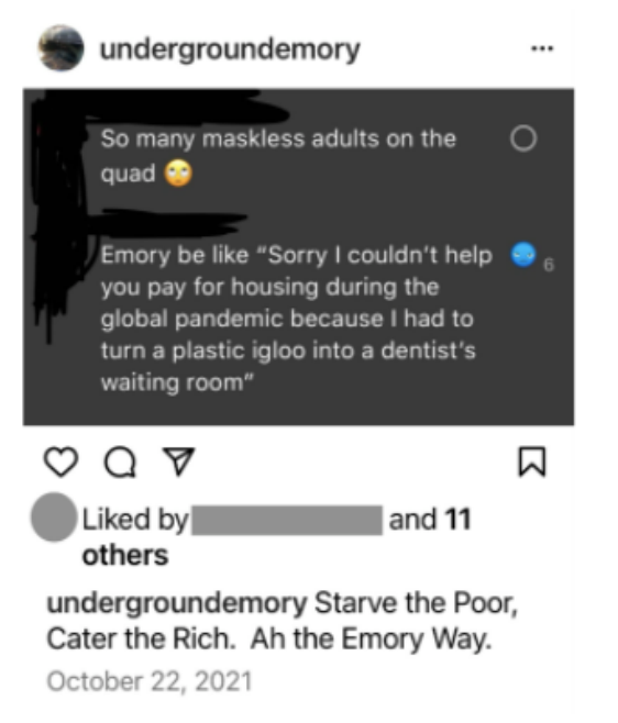
Figure 8. A screenshot of one of the FLI student group chats criticizing the 2036 campaign.

Because while Emory envisions a future for itself, its first-generation, low-income students cannot. How could these students look ahead when there were so many issues that tied them to the problems of the present)? When the