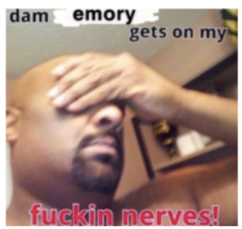
Figure 6. A student-created meme that addresses the frustration and disappointment experienced by FLI students.

Soon, the chats were ablaze with angry FLI students, and memes were made within a