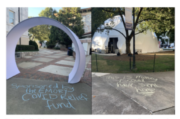
Figure 7. Chalkings from a student protest against the allegations of misallocation of COVID relief funds.

already disgruntled over the numerous wrongs committed by the university. In their eyes, it could only be true. Sponsored by the Emory COVID Relief Fund and This is money I could have sent home ( Figure 7 ) emerged on the Quad in resistance to 2036. The tension in the air could not be missed, and soon, student leaders of these organizations found their inboxes flooded with messages of Wow, I never felt more cheated .