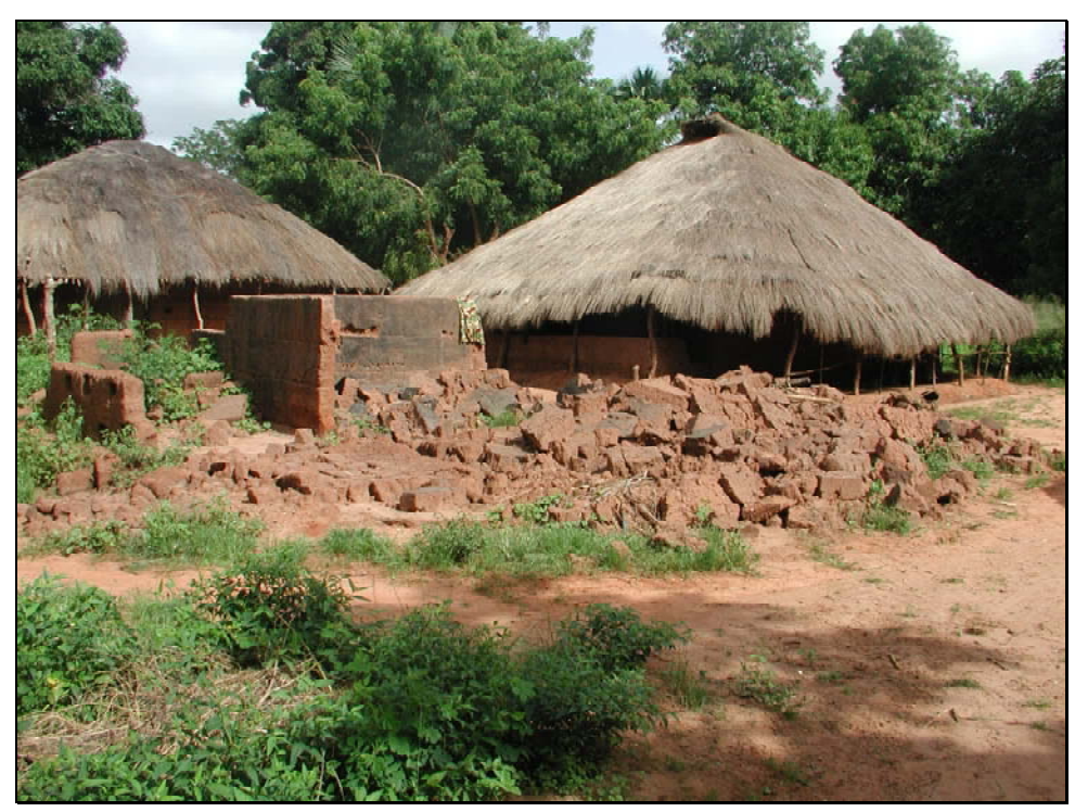
A demolished eluupai