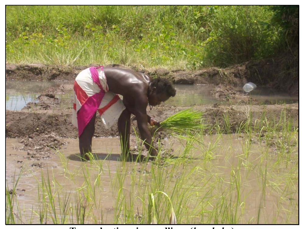
Transplanting rice seedlings (borokabu)