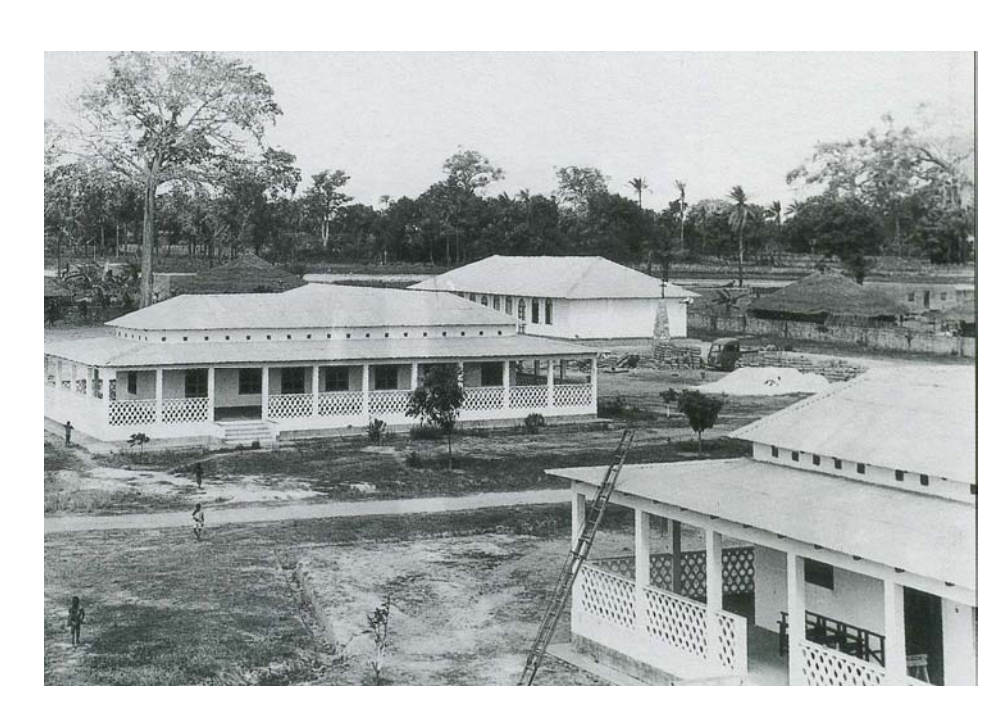
Construction of the PIME Mission facilities in Susana. Nuns' house in background, priests' house in foreground, and the first church (later dismantled) in the far background (Gheddo 1999).

These buildings are surrounded by a brick wall, topped by a barbed wire fence that gives the entire complex an intimidating, fortress-like feel. The structures themselves are unlike any in the surrounding area; they are made of concrete and tile roofs, and stand out in sharp contrast to the mud and thatch houses that comprise the rest of the village. The entrance to the Mission—two large, creaking iron gates—remains closed unless one of the priests or nuns needs to drive their car in or out, after which they are promptly shut. Overall, the Mission has a rather uninviting physical presence, and there is very little traffic between the Mission grounds and the rest of the village. Those that do enter the Mission gates do so with trepidation. The priests and nuns are rarely seen outside the