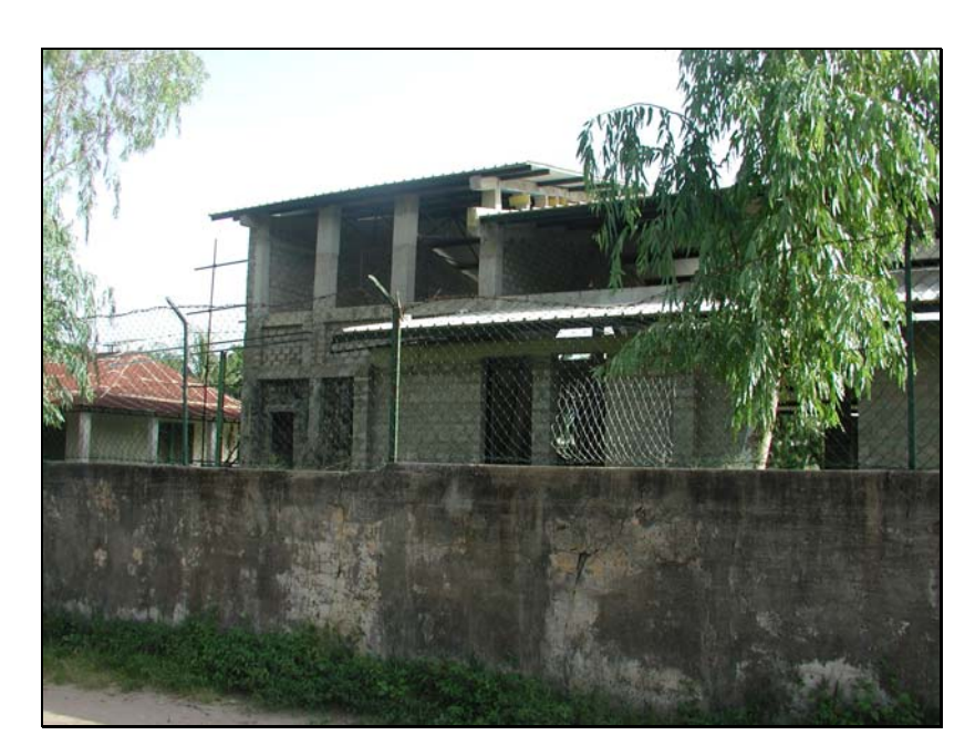
Walls and fence surrounding PIME Mission