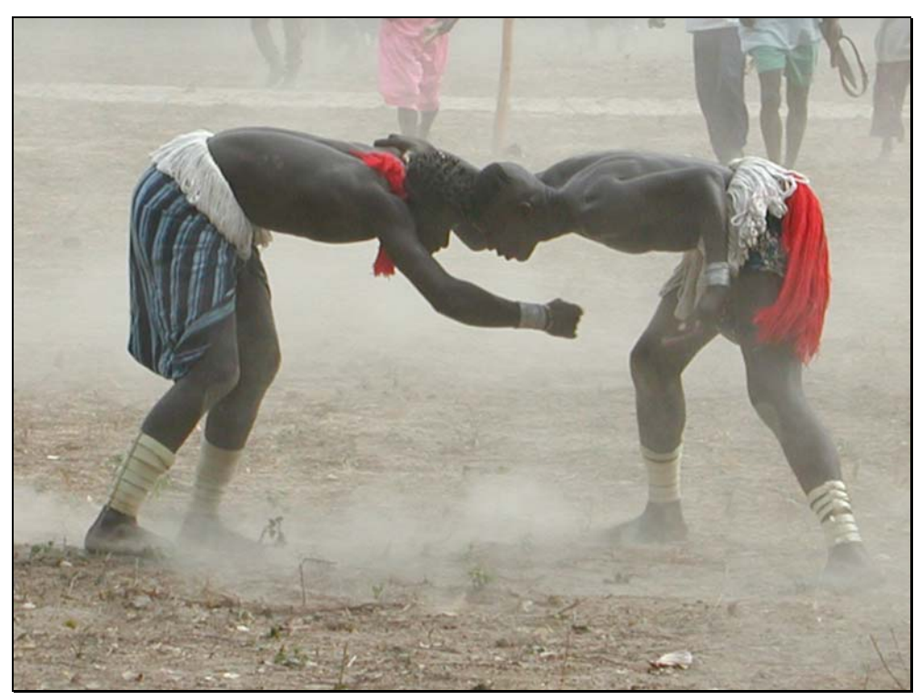
Wrestling match, Karuay 2002