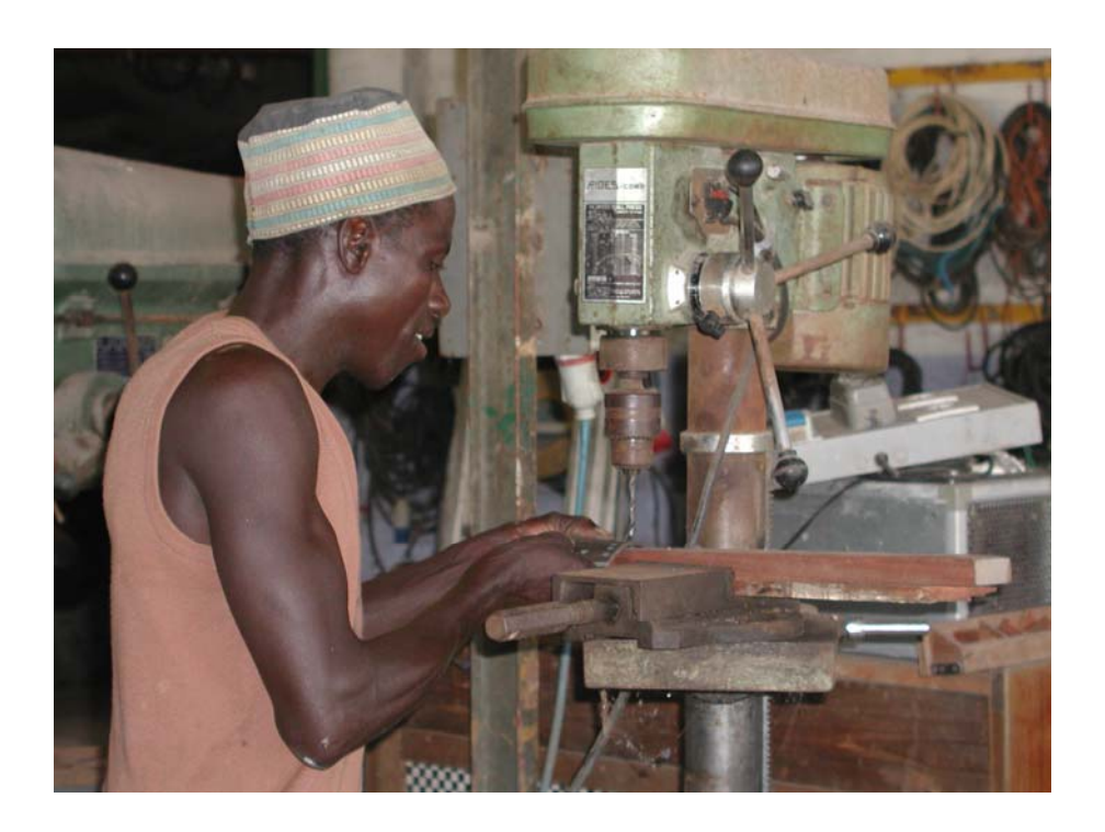
A Diola Christian working in the oficina

legal position to take on work outside the Mission itself. Because of the oficina , with its constant generator hum and power tool whine and busy Diola workers in an otherwise completely non-industrial setting, the Mission often appears to be more of a well-functioning business enterprise than a religious institution.