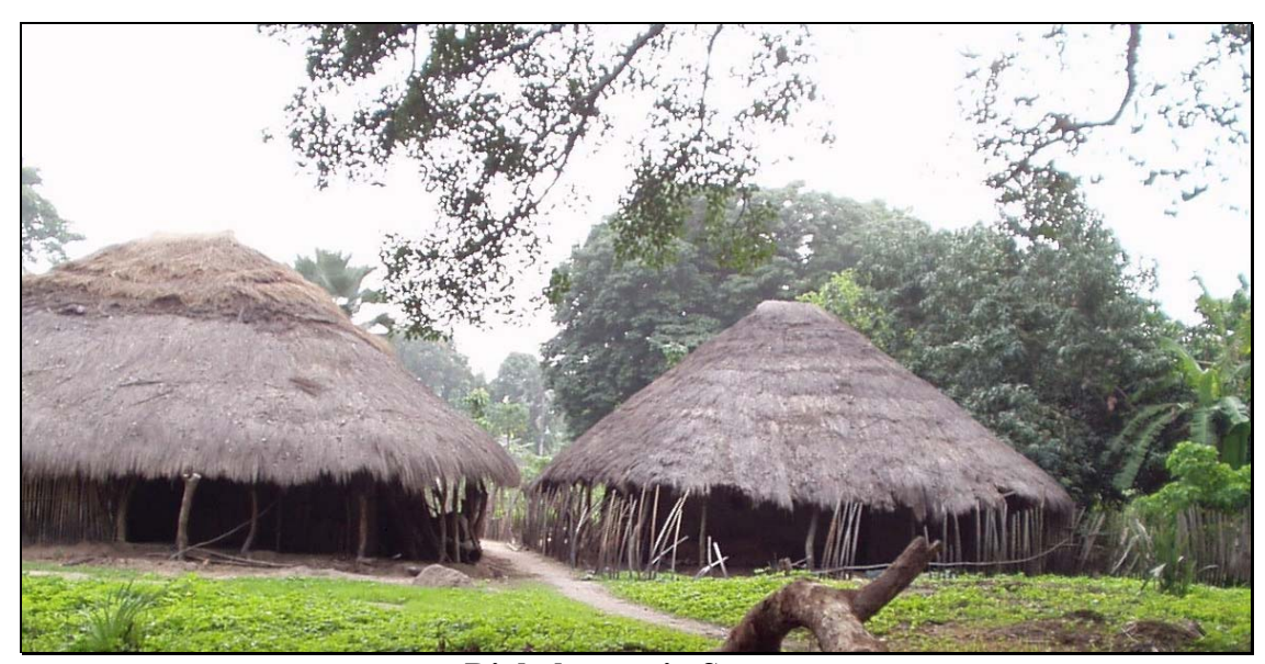
Diola houses in Susana