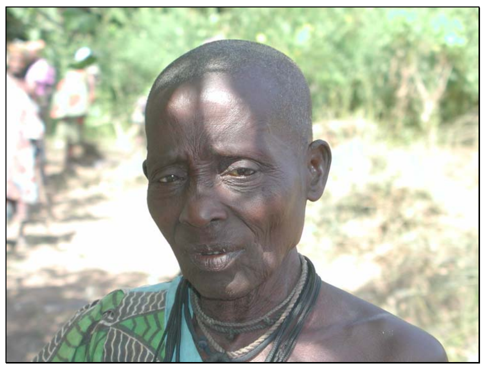
A Susana widow