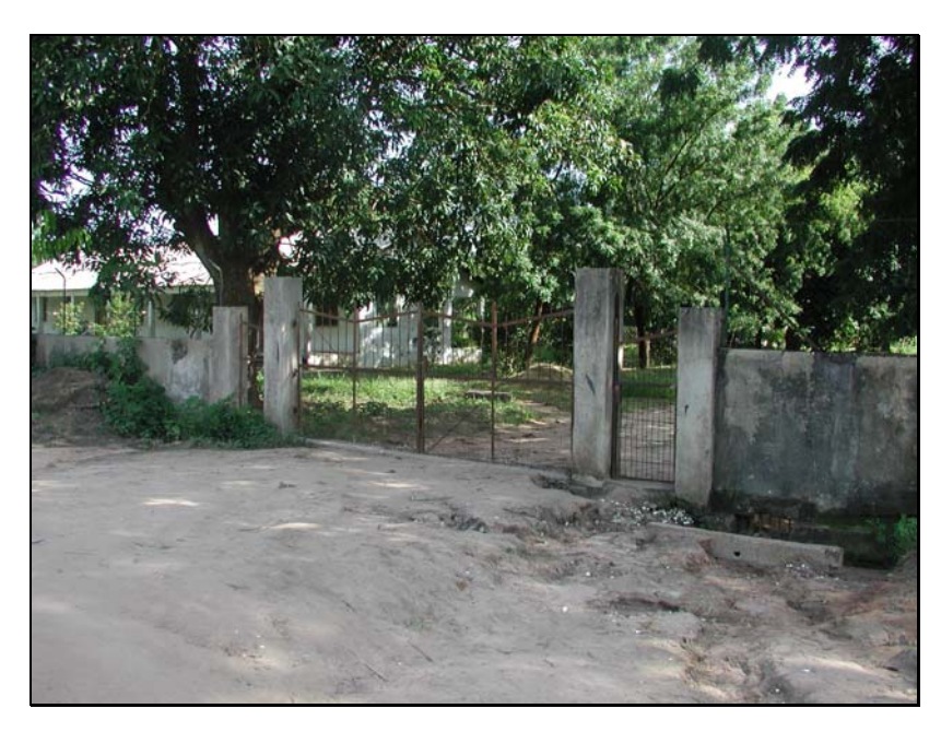
PIME Mission entrance gates