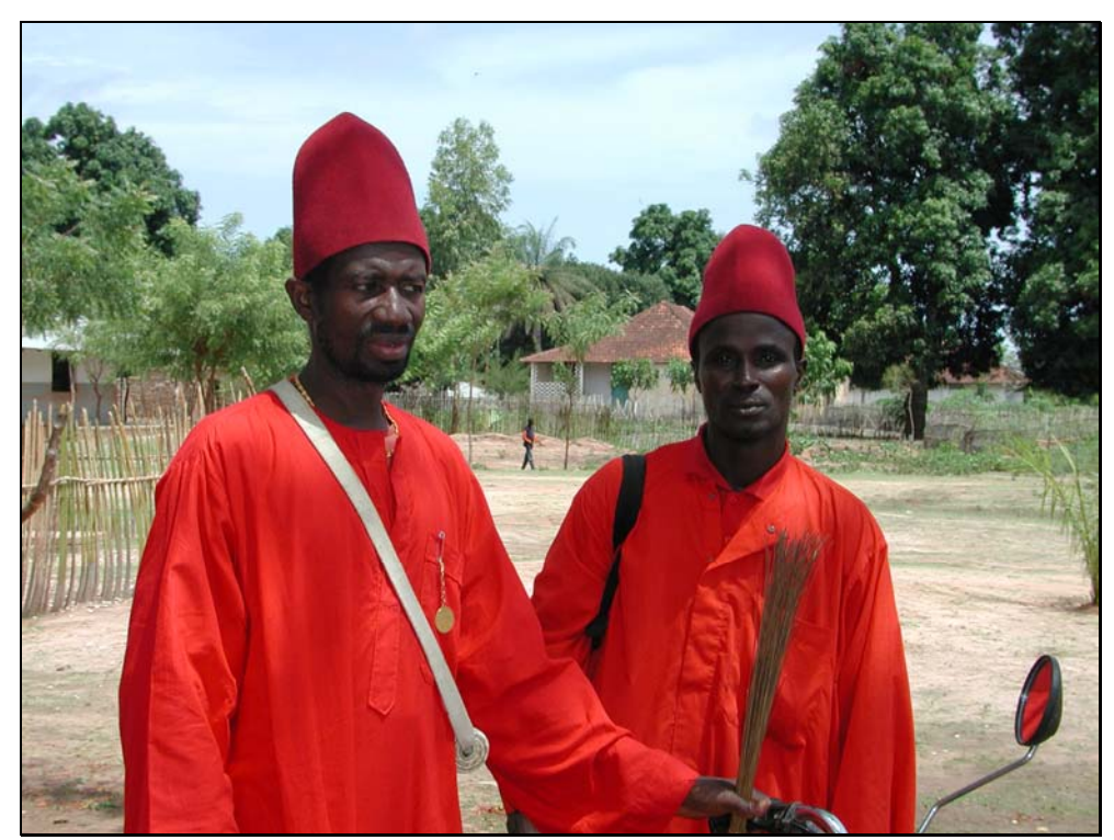
Diola ai-ì , 2002