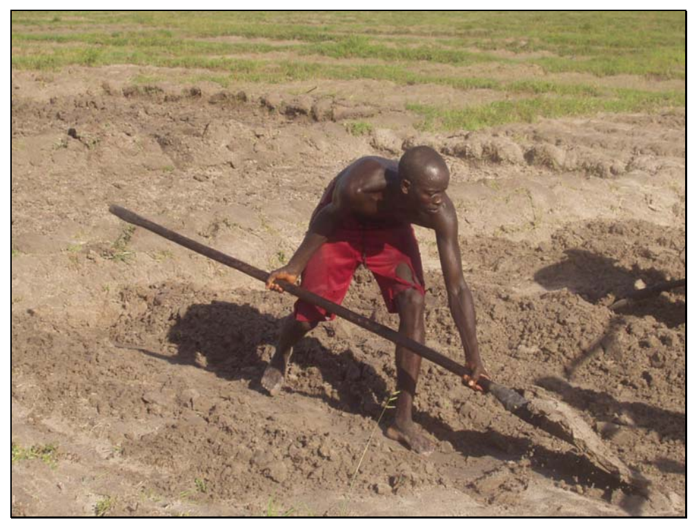
Tilling the rice paddies (ewañai)