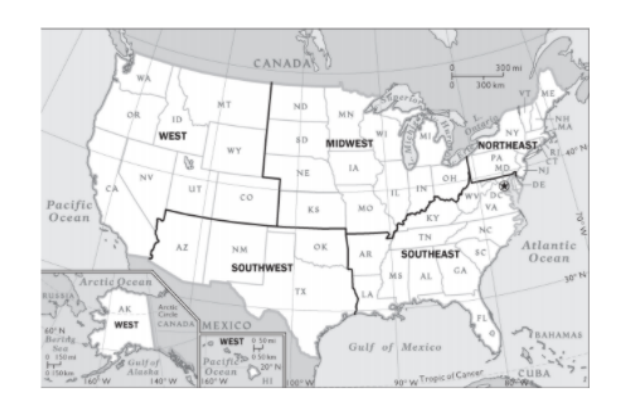
Map of the United States by Geographic Region

lack of access is much more prevalent in certain regions. In the Southeast, all states except Virginia have severely restricted access to abortion. In the Southwest, all states except New Mexico have severely restricted access to abortion. In the Midwest, four of the twelve states (Illinois, Minnesota, Iowa, and Kansas) do not have the designation severely restricted