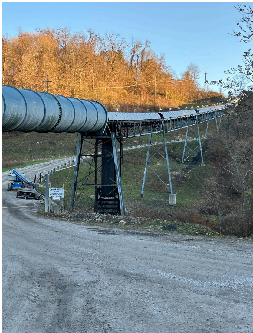
Figure One: The Tunnel Ridge mine a few minutes from one of the houses I stayed in as a kid.