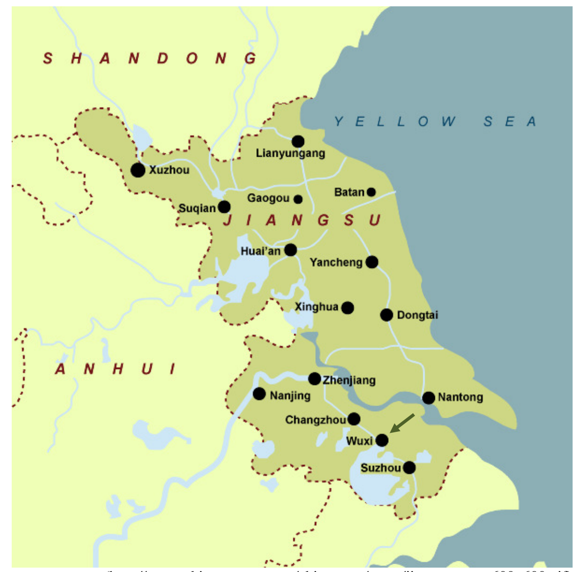
Figure 2: Map of Jiangsu province with Wuxi highlighted