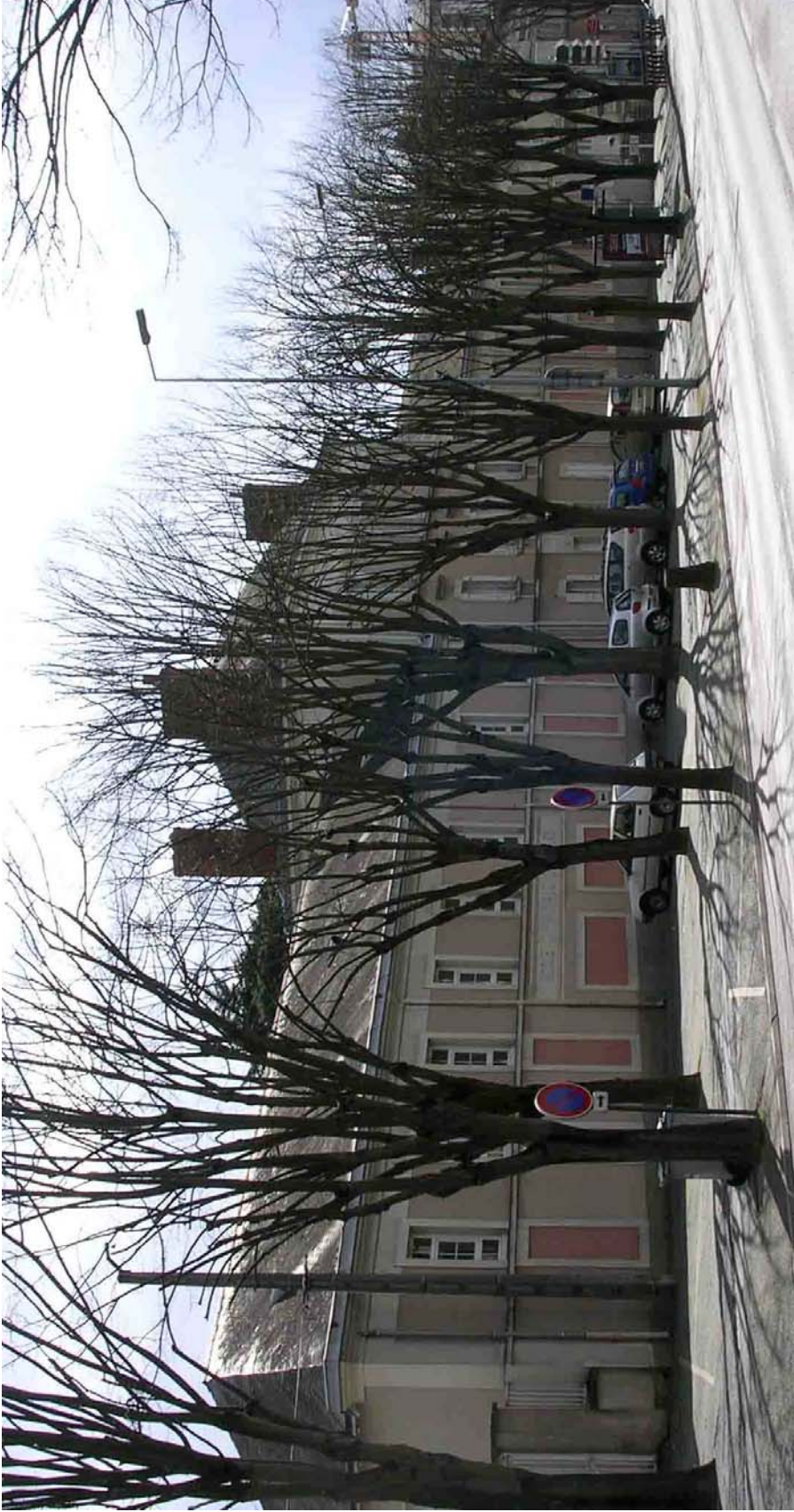
Figure 1: The École élémentaire André Moine, February 2005. The wing to the left of the central structure (closest to the viewer) is the former école mutuelle de filles ; the école mutuelle de garçons is to the right.