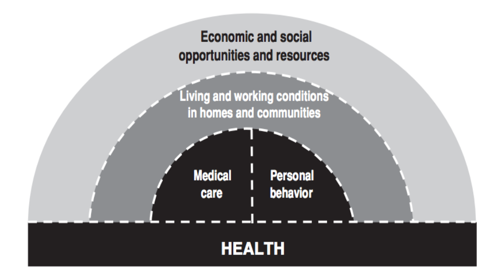
Figure 1: Social Determinants of Health Framework: Upstream and Downstream Determinants (Braveman et. al., 2011)

Within the framework, downstream determinants are understood as factors that are the most proximal to the individual and have the potential to determine health outcomes. These are factors such as smoking, exercising, and other health-related attitudes, beliefs, or behaviors. However, in isolation, addressing these factors may only temporarily solve the health issue and do little to address socioeconomic disparities that determine who has access to health promoting programs, interventions, and receipt of care. Conversely, upstream determinants are conceptualized as fundamental causes that set-in motion causal pathways that facilitate health effects through downstream factors. Upstream determinants are characteristics of the larger social, political, and economic environment that influence who, when, and where resources are allocated, which in-turn have effects on health outcomes through their influence on downstream determinants. The SDOH framework highlights how health is shaped not only by our personal health