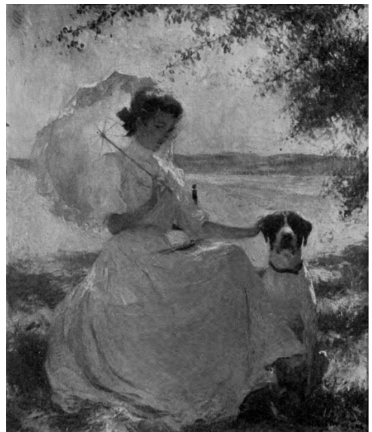
Fig. 13. Frank Weston Benson, Elizabeth , c. 1909. Presumed Lost. Official Catalogue of the Department of Fine Arts: Alaska-Yukon-Pacific Exposition, Seattle, Washington 1909.