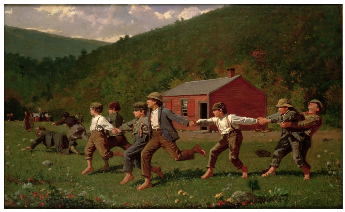
Fig. 16. Winslow Homer, Snap the Whip , 1872. Oil on canvas, 22 X 36 in. Butler Institute of American Art; Museum Purchase 1918.