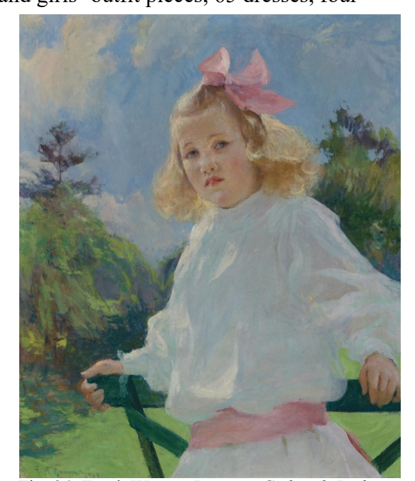
Fig. 24. Frank Weston Benson, Girl with Pink Bow , 1905. Oil on canvas, 30 1/8 X 25 in. Pennsylvania Academy of the Fine Arts; Mary Cassatt Fund. 2009.1.

blouses, and two short jackets are white, recalling the white, frilly dresses Benson's daughters typically wore when sitting for their portraits. Many of these dresses and blouses are trimmed with colorful sashes and neckerchiefs, resembling the styles apparent in paintings such as Girl with Pink Bow (Fig. 24) and The Hilltop (1903; Malden Public Library), which shows Eleanor outfitted in a billowing white dress tied at the waist with a blue sash. Other outfits in the Colton Collection differ in color but match dress patterns seen in Benson's paintings. For example, a