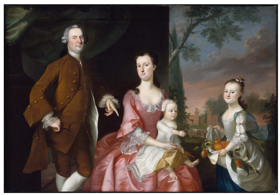
Fig. 15. Joseph Blackburn, Isaac Winslow and His Family , 1755. Oil on Canvas, 54 \frac{1}{2} X 79 \frac{1}{4} in. Museum of Fine Arts Boston; A. Shuman Collection – Abraham Shuman Fund. 42.684.