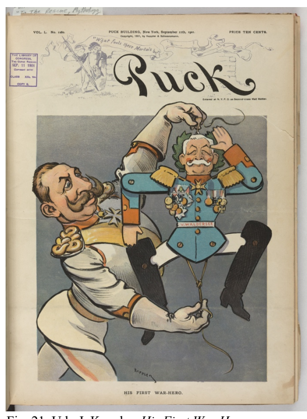
Fig. 21. Udo J. Keppler, His First War Hero , September 11, 1901. Chromolithograph. Library of Congress. Illus. in AP101.P7 1901. This political cartoon shows the German Emperor Wilhelm II controlling a pantin of the German field marshal Alfred von Waldersee.

It was only when pantins came to England, where they were called "jumping jacks," that paper figures were viewed as