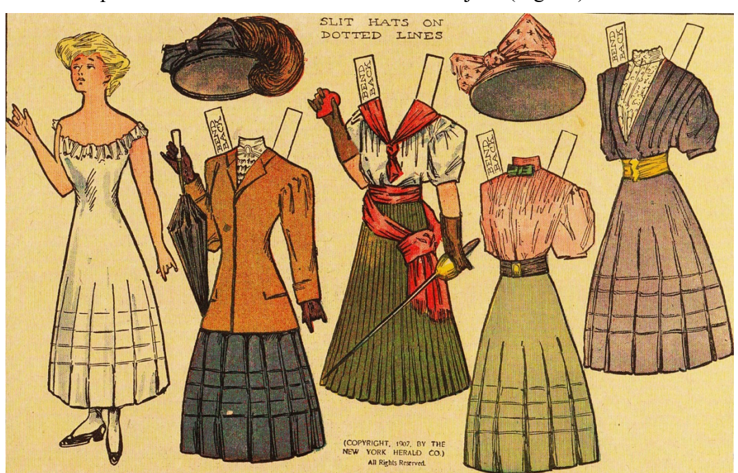
Fig. 31. The New York Herald, Fluffy Ruffles, 1907.

(1862-1942), whose life as a working woman was serialized in the New York Herald . Each Sunday, a full page in the paper was dedicated to Fluffy Ruffles's attempts to find gainful employment. From teaching dance classes to dressing shop windows, Fluffy tried almost every conceivable career available to women at the time. Unfortunately for Fluffy, who needed to work to make up for her lack of inheritance, each week the men at her new workplace would disrupt her productivity by ogling at and flirting with her. The story would inevitably end with either her resignation or dismissal. Fluffy's inability to hold a job did not stop her from becoming a symbol of female independence and dedication in the workforce, however. Her series was a major success, especially among young women. She inspired clothing lines, songs, and even a short-lived Broadway musical that included a speech advocating women's suffrage. Along with the weekly comic strip, the New York Herald produced its own popular Fluffy Ruffles paper dolls, equipped with the professional attire needed for her various jobs (Fig. 31).<sup>49</sup>