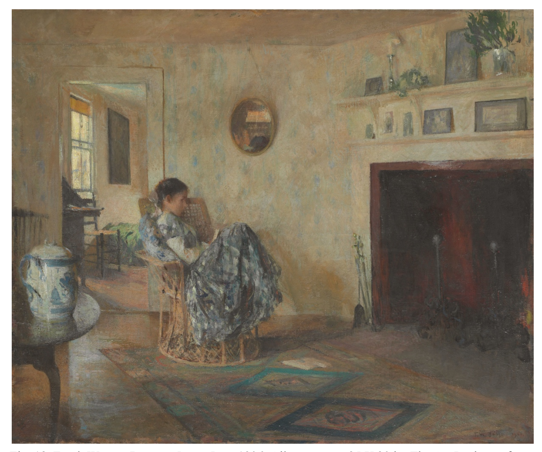
Fig. 18. Frank Weston Benson, Rainy Day , 1906. Oil on canvas, 25 X 30 in. The Art Institute of Chicago; Friends of American Art Collection. 1910.314.