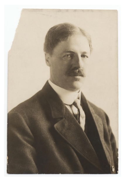
Fig. 29. Haeseler, Frank Weston Benson , c. 1895. Black and white photographic print, 6 ½ X 4 ¾ in. Archives of American Art.