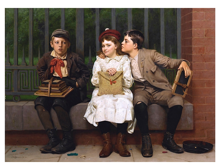
Fig. 8. John George Brown, Not in It , n.d. Oil on canvas, 28 X 38 in. Private Collection.