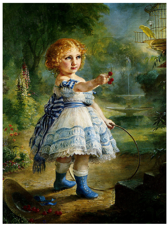
Fig. 5. Lilly Martin Spencer, Will You Have Some Fruit? 1871. Oil on canvas, 34 X 42 ¾ in. Private Collection.