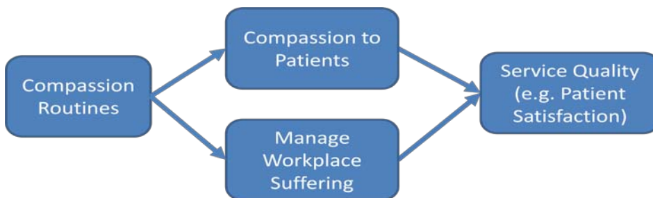
Figure 4: Theorized Relationship between Espoused Compassion, Compassion Routines and Service Quality