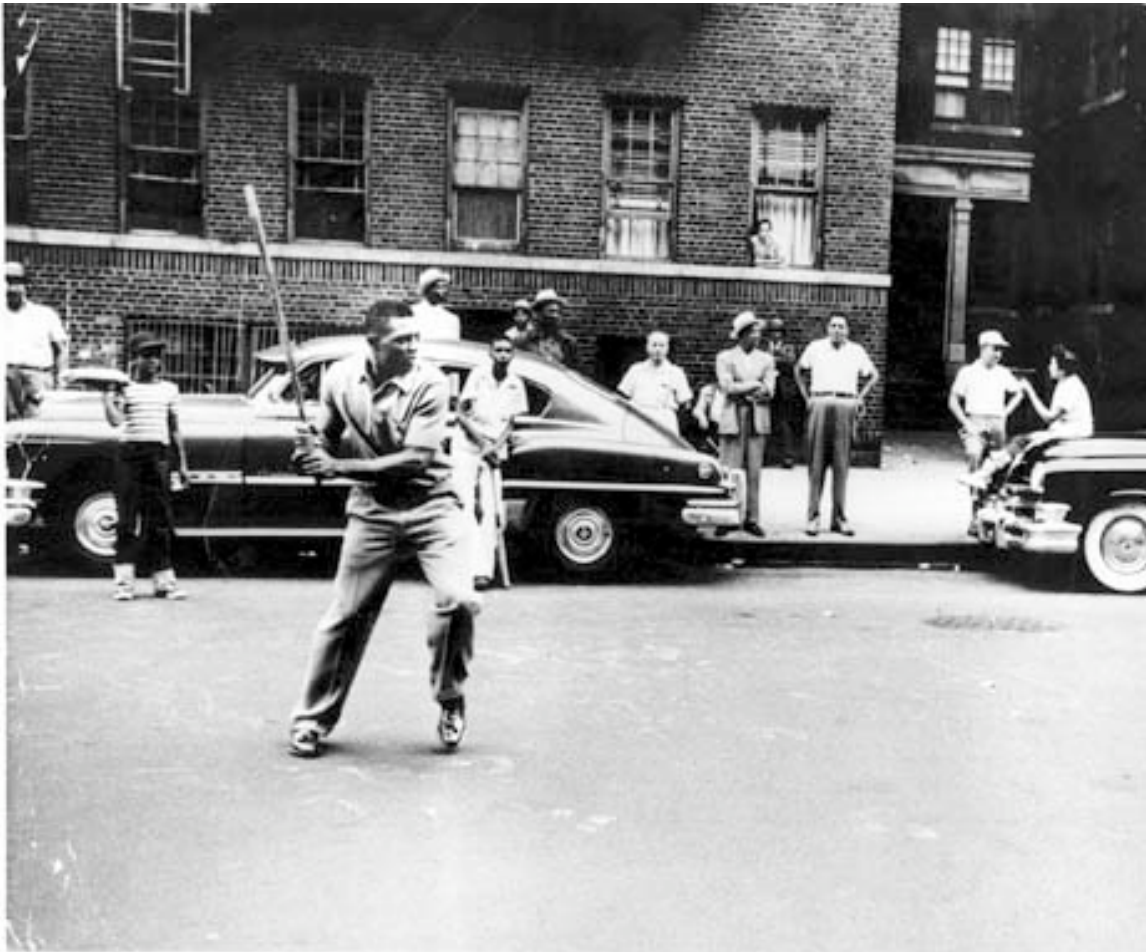
National Baseball Hall of Fame and Museum

a comfort with his environment, and the nonchalance of the sidewalk viewers suggests that Mays' presence is common and natural. It is as if Mays is on the neighborhood team, having a little innocent fun before heading to the ballpark to help the Giants win the 1954 World Series.