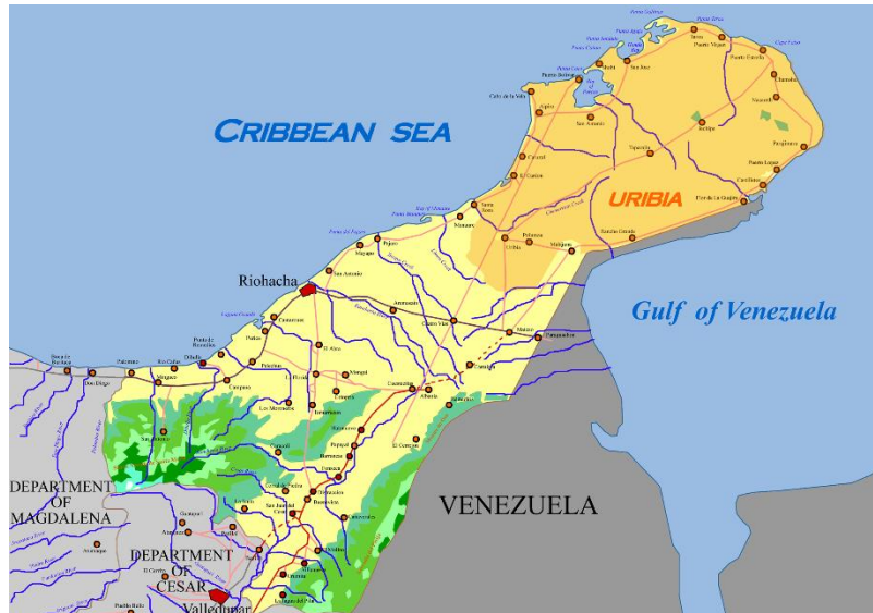
Figure 2. Map of La Guajira (2)

The largely desertic La Guajira department is located in the northernmost tip of Colombia, between the Caribbean Sea and the Gulf of Venezuela. According to the Colombian statistical bureau 2005 census, 45% of La Guajira population is indigenous, and among the indigenous groups the