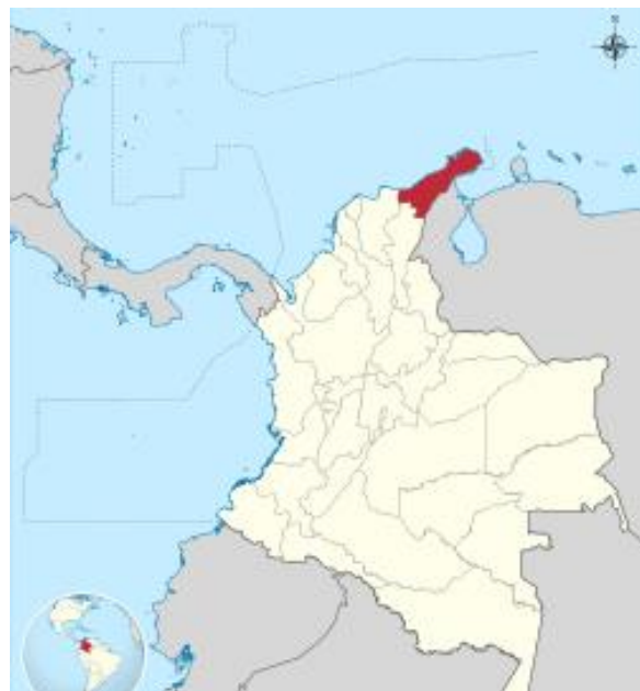
Figure 1. La Guajira Department in Colombia (1)

While malnutrition rates among children were steadily declining in the majority of high-middle income Colombia, La Guajira department (historically a province with a large low-income population) had shockingly high rates of infant mortality. In 2013, an estimated fifty children died for every 1,000 live births, far above Colombia’s national average of 13 per 1,000 (18).