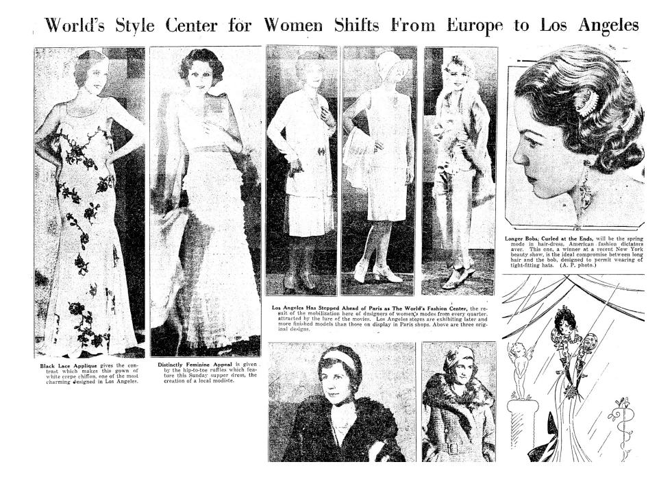
Fig. 2 "World's Style Center Shifts from Europe to Los Angeles," Los Angeles Times , 9 Mar 1931, 8.

Together the images and captions support the claim that Los Angeles had overtaken Paris within the fashion world and in the minds of female consumers. Films apparently now influenced everything from evening wear to day gowns and even hairstyles.