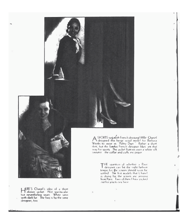
Fig. 3 "Here's what Paris Designs for the Stars," Photoplay, Sept 1931, 44.

a piece of characterization/mise-en-scene. The extra-textual factor, in which costumes become "fashion" within promotional campaigns, can be seen in an early Photoplay article focused on Chanel's work on Palmy Days . Interestingly, the photo spread which accompanies the article refutes The Los Angeles Times ' early claim that Chanel didn't want photographs taken of her designs. The images of Weeks wearing Chanel's gowns were featured within the recurring "Seymour" column which, each month, focused on the newest Hollywood clothing trends as well as specific film costumes. The article on Palmy Days was actually the first time Chanel's designs were seen by the public, allowing Photoplay to declare it was a "scoop" story in order to pique reader interest. As for Goldwyn, the magazine gave him an early way to promote a Cantor film to female audiences: