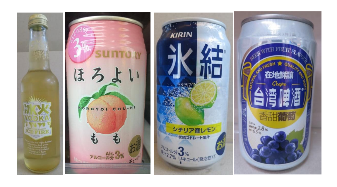
Figure 4.1 . Examples of alcopop packaging designs that enable adolescents to "pass" as non-alcoholic drinks: (a) The Ice Fire with a transparent glass-ware bottle; (b) The Suntory Holoyoi with a picture of peach and a "girly" pink background; (c) The Kirin Zero with a picture lemons and a modern 3-dimensional background; (d) Fruit flavored Taiwan Beer with a picture of grapes