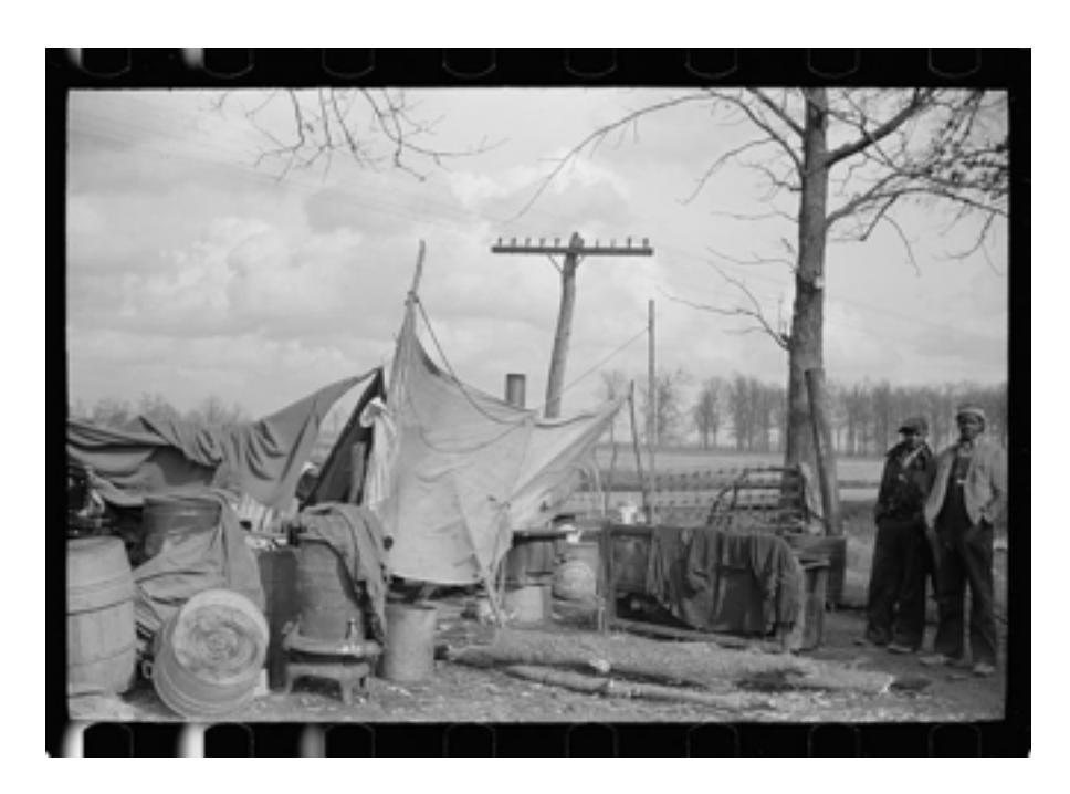
Figure 3: A photo of the Missouri Sharecroppers Strike of 1939<sup>85</sup>

local Black churches that Whitfield preached at were some of the few safe havens they had.<sup>84</sup> At the time the protest occurred few people other than the sharecroppers who would participate knew it was going to happen. Whitfield had gotten the word out through his network of Black churches and his Workers Council, Thad Snow knew because Whitfield had told him, and a reporter for the St. Louis Post-Dispatch was alerted that a protest would be happening in the near future.