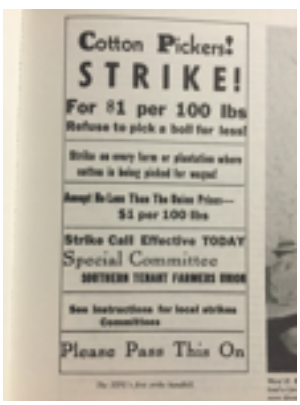
Figure 2: A flyer used to alert sharecroppers in Northeast Arkansas to the STFU's first strike in 1935<sup>10</sup>

tenant farmer in 1935 was $225,7 though little of that money actually went into the pocket of the farmer. Most of the money a tenant farmer made on his goods went to paying for the use of the land and what was known as "the furnish" or the goods and seeds the landowners provided the tenant farmer to produce the crop, along with an interest fee of ten per cent. When land usage was cut the tenant farmer had less work to do while getting none of the subsidy check intended to support him. This was the case in many areas in the south, particularly those dominated by single crop farming, usually cotton. This was true especially in the upper regions of the Mississippi Delta, where the Southern Tenant Farmers' Union had its beginnings.