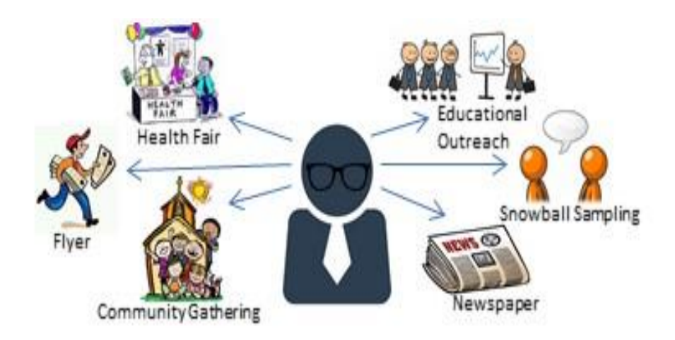
Figure 2. Variety of recruitment efforts used to engage Atlanta API community