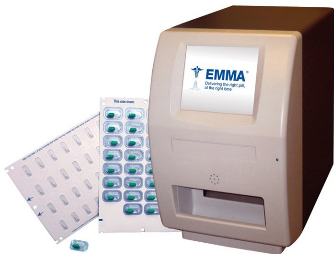
Depiction of an Electronic Medication Management Assistant (EMMA®)