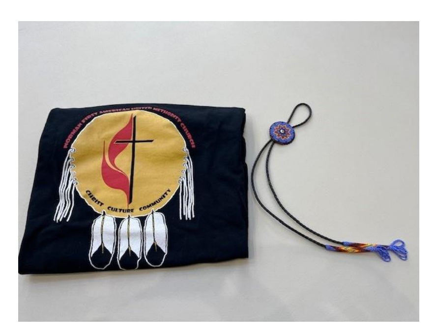
NFA t-shirt and hand-beaded bolo tie Gift from NFA to McFarlin's United Methodist Men 2004