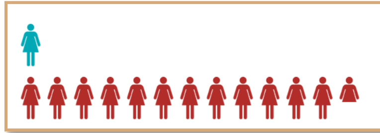
Figure 1. The rate of black females living with an HIV diagnosis in Georgia is 12.6 times that of white females (AIDSVu, 2016).

compared to their White counterparts. Comparison rates for HIV prevalence rates among White and African American women in Georgia can be seen in Figure 1.