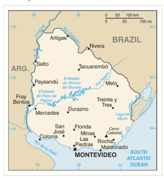
Figure 2: Map of Uruguay (CIA, 2014)

In 2004, following more than two centuries of a two-party system dominated by the Colorado and Blanco parties, the left-leaning Frente Amplio Coalition won the national elections (Nolen, 2014). In 2009 José Mujica, a former guerrillero and political prisoner, was elected as President of the Republic. Mujica, affectionately known as Pepe, has used his political power to make Uruguay one of the most socially liberal countries in Latin America. It was under Pepe's presidency, in October of 2012, that first trimester abortions were decriminalized (Nolen, 2014).