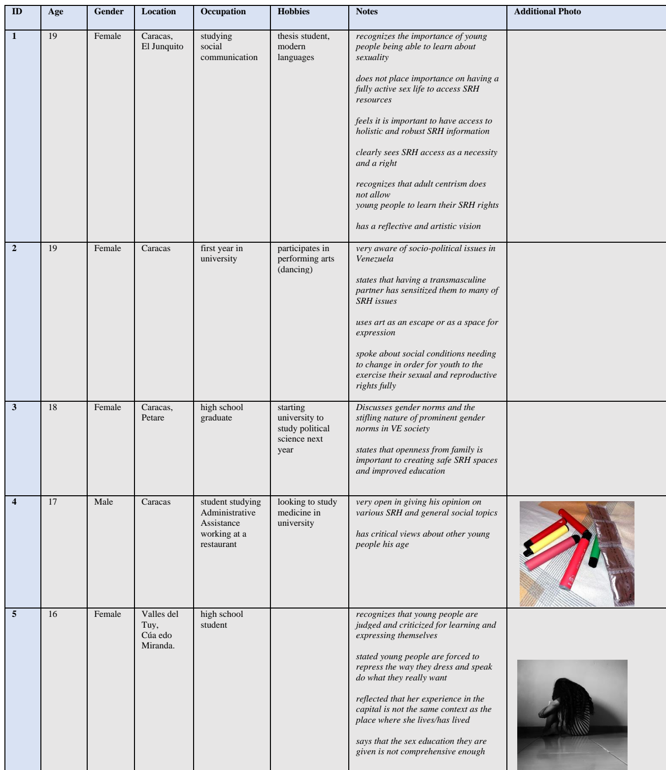
Table 1. Characteristics of Participants (N=10)