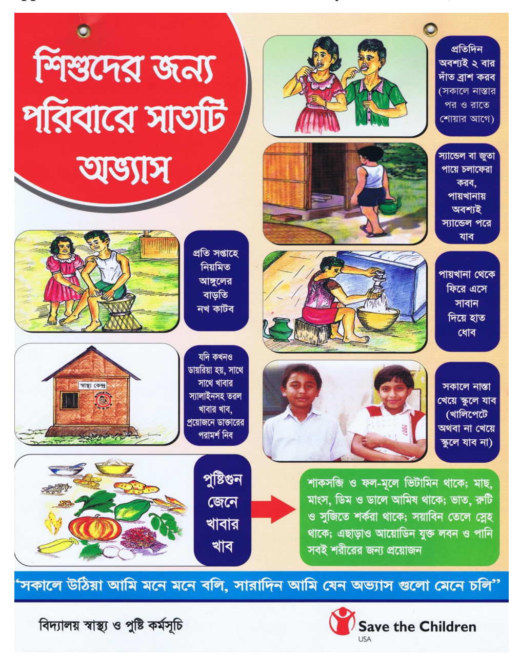
Appendix 6: Shishuder Jonno's "Seven Healthy Habits" Chart, 2010