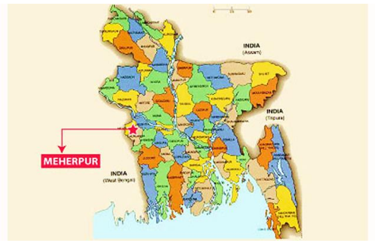
Appendix 1a: Map of Bangladesh*