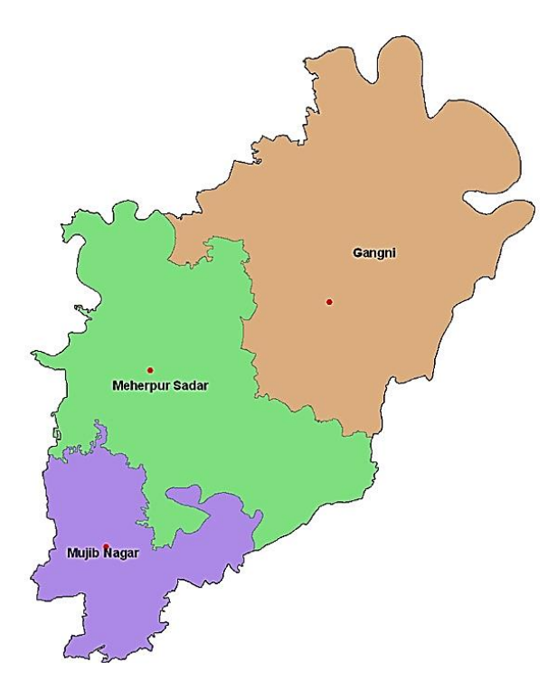
Appendix 1b: Map of Meherpur, Bangladesh with 3 subdistricts*