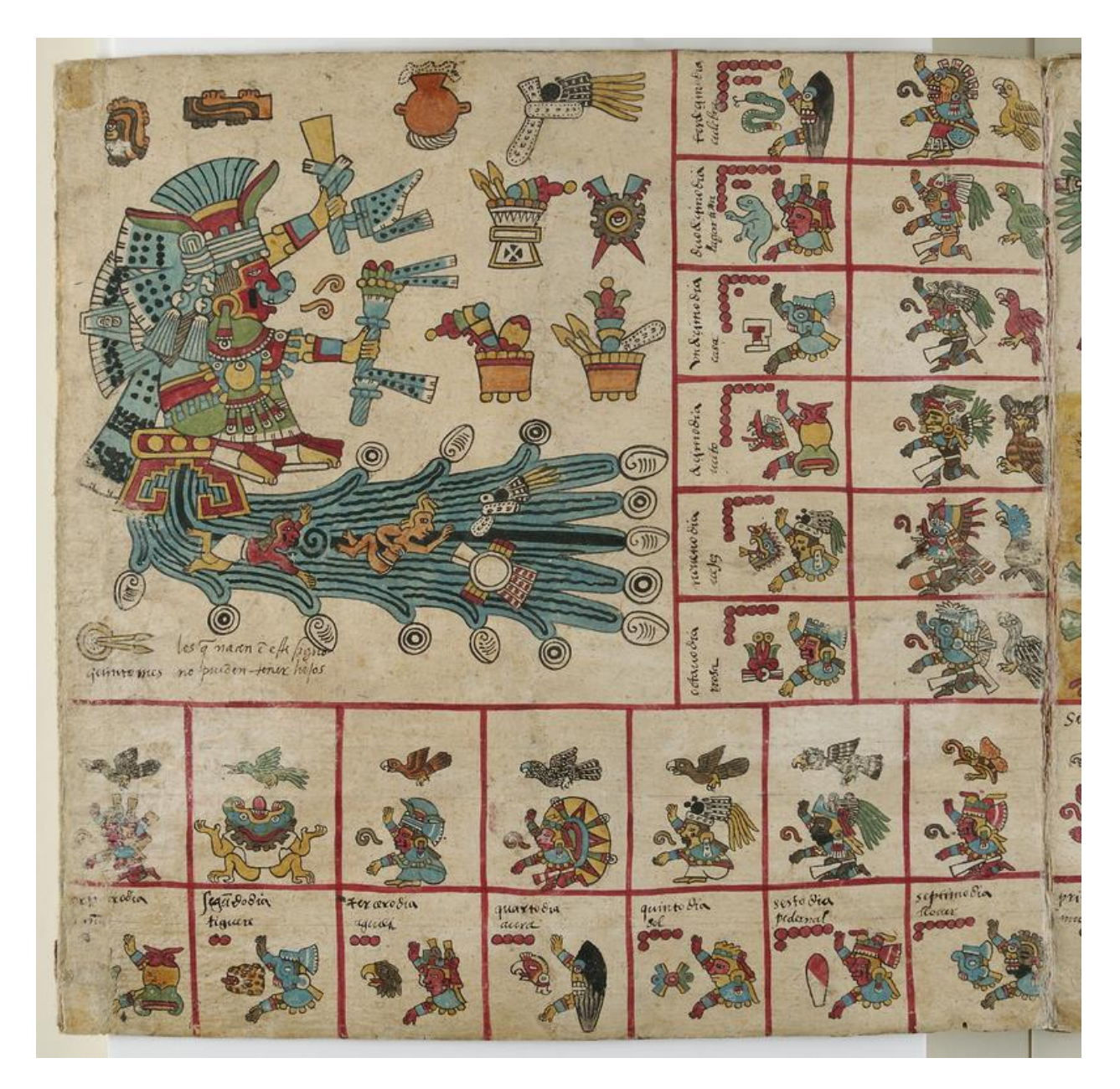
Figure 9: Codex Borbonicus, Unknown maker, mid-16<sup>th</sup> century, Mexico, North America, amate paper and pigments