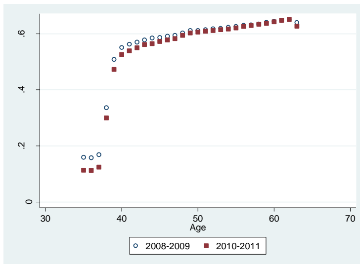
Figure 2: Mammography Screening Rates by Age

Figure 2 shows pre-recommendation and post-recommendation trend in biennial mammography screening rates from age 35 to 63. The screening rates sharply increased and continued increasing from the age of 40. Compared to the pre period (2008-2009), the biennial screening rates, in the post period (2010-2011), decreased for women aged 40 to 49, and were nearly unchanged for women aged 50 to 59. The differences in screening rates were larger for women right around age 40. The screening rate among women aged 39 was 50.8% and 47.2% in the pre period and the post period, respectively. It was 55.1% and 52.6% respectively among women aged 40, 56.2% and 54.0% among women aged 41, and 57.0% and 55.0% among women aged 42 .