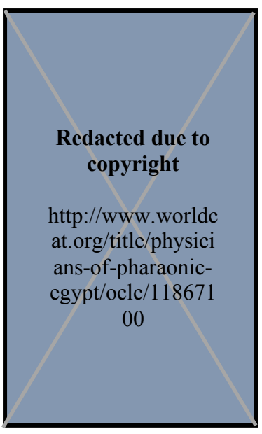
Figure 3. Line drawing of the Stele of Peseshet. Her title imyr-3 swnw-t appears in three places: (1) in front of the seated figure (the owners of the stele) in the upper register, (2) above the figure in the right jamb, (3) the left middle of the lowest register. Ghalioungui 1983: Figure 8.<sup>82</sup>