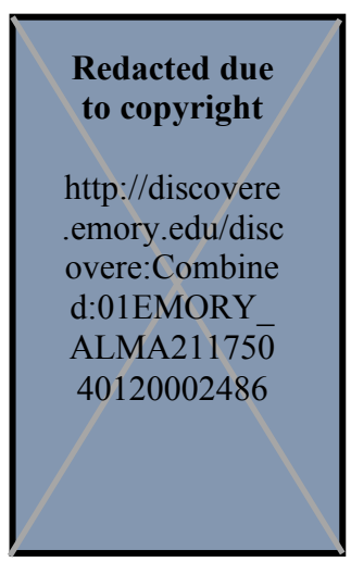
Figure 1. Map of Egypt. Szpakowksa 2008: courtesy of JJ Shirley: Figure 1.1.<sup>46</sup>

Lahun was a thoroughly planned city, laid out according to social status and wealth. A wall separated the Western and Eastern quarters, the former of which was a neighborhood of small to medium sized mudbrick homes and latter is defined by palatial estates, situated advantageously along the north edge to take advantage of passing breezes.<sup>47</sup> Despite being a vibrant center, Lahun was abruptly abandoned during the thirteenth Dynasty<sup>48</sup> – leaving many objects used in daily life untouched in their homes until Lahun was excavated in 1889. The reason for the seemingly sudden evacuation is unclear as the Middle Kingdom ended rather gradually and without much blood shed; the Heqau-khasut (now called Hyskos) lived alongside Egyptians for over a century, slowly gaining power, and eventually taking control of Lower Egypt.<sup>49</sup> However, there are no later occupation layers above the Middle Kingdom deposits at Lahun.<sup>50</sup> Whatever the cause, royal funding certainly must have ceased.