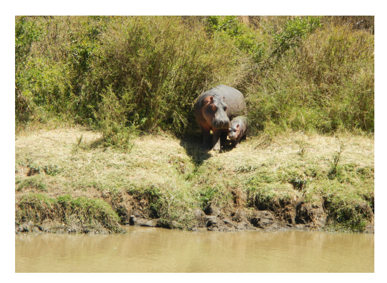
Figure 9. Mother and child Hippopotami in the Mpala Research Centre and Wildlife Center, Laikipia County, Kenya.

Hippopotami are fiercely maternal animals that closely monitor their young, and roar forcefully at the slightest indication of a threat, before becoming violent. This behavior, and the fact that hippopotami bear only once child at a time,<sup>309</sup> make the hippopotamus an ideal form for the protective goddess of pregnant women. The nearly ubiquitous representation of Taweret of birthing wands is also indicative of how powerful her image was;<sup>310</sup> as much harm and trouble as hippopotami could cause humans, Taweret could inflict an equal amount, if not more, upon evils seeking to harm a mother-to-be.