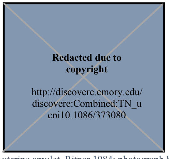
Figure 7. Greco-Egyptian uterine amulet. Ritner 1984: drawing by W. Raymond Johnson, Figure 1.<sup>168</sup>

This case directs the swnw to insert a small quantity of onion into the patient's "mouth on [her] belly," which we should understand to mean vagina. The view of the mouth and vagina as analogous orifices reflects the ideation of female internal anatomy as a long vessel that connected the face and genitals, and is mirrored in the Hippocratic corpus.<sup>165</sup> In fact, ancient Egyptians believed that menstrual blood could leak from the mouth, ears, and nose if not diverted for other purposes.<sup>166</sup> The imagery of the vagina as the mouth of the uterus is explored by Ritner in his examination of a Greco-Egyptian uterine amulet from Hellenistic Egypt (Figure 7). The obverse depicts three deities – Isis, Osiris, and Nephthys – above a stylized uterus (the circle and semi-circle) accompanied by a stylized key.<sup>167</sup>