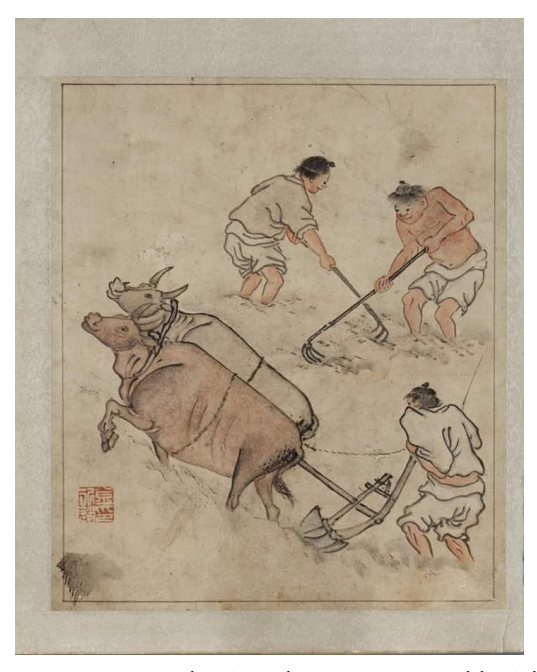
Figure 3.4 Hongdo Kim, Plowing a Rice Field , 18th century, paper, National Museum of Korea, https://www.museum.go.kr/site/eng/relic/represent/view?relicId=530

The cow's anthropomorphic qualities are accentuated by the actor's movements, and recorded productions of the play show actors moving similarly to the stylized manner of kwangdae , expressing the script's humor in the same speech patterns. For example, the bureaucrats in the