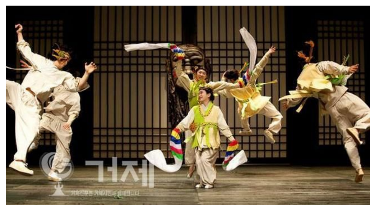
Figure 2.6. 10<sup>th</sup> anniversary kwangdae act on stage in 2010.

The Pang-sang-shi from the first scene is in the background, but the clowns pay no heed and do as they are accustomed to. They do it simply for their own enjoyment, stifled by the palace strictures, despite the luxuries it offers, and noting the lack of free speech as court performers: