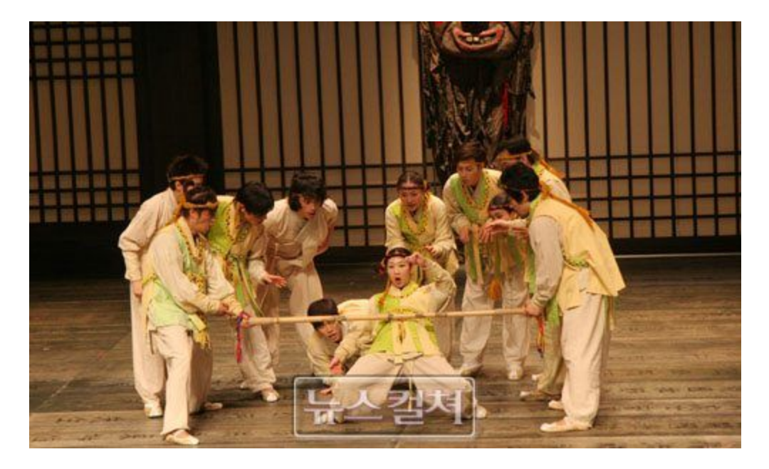
Figure 2.5. The kwangdaes in the 2010 The Clowns production.