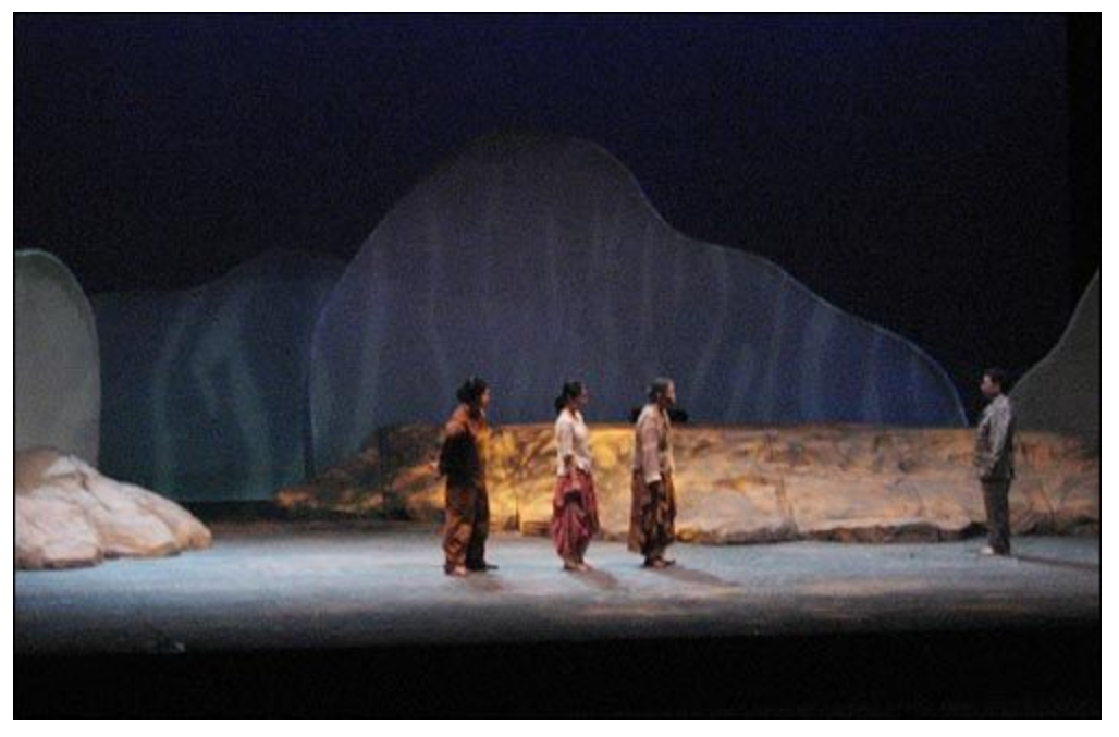
Figure 3.1. A 2006 production of Oh Chang-gun's Toenail .

While traditional elements are less evident here than the other plays under consideration, the set design shown in production photos pays homage to traditional Korean visual arts, with its depiction of mounded hills.