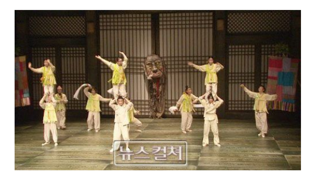
Figure 2.4. The kwangdaes in the 2009 The Clowns production.