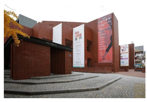
Figure 2.1. Arko exterior