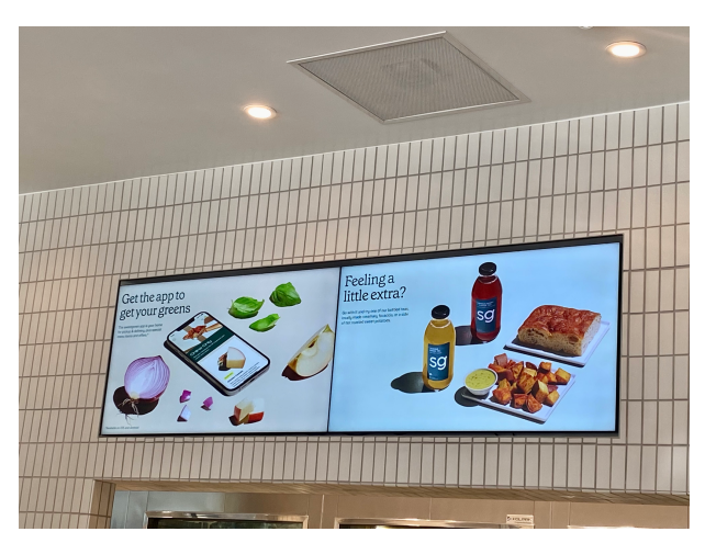
[Figure 8. Image of Sweetgreen menu and app promotion board captured during the opening of Sweetgreen West Midtown on March 18<sup>th</sup>, 2022.]