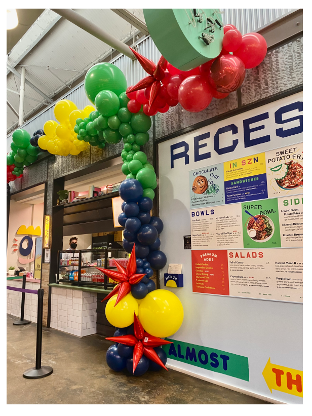
[Figure 2. Recess Krog Street Market. The picture was taken at their reopening on 2/28/2022.]