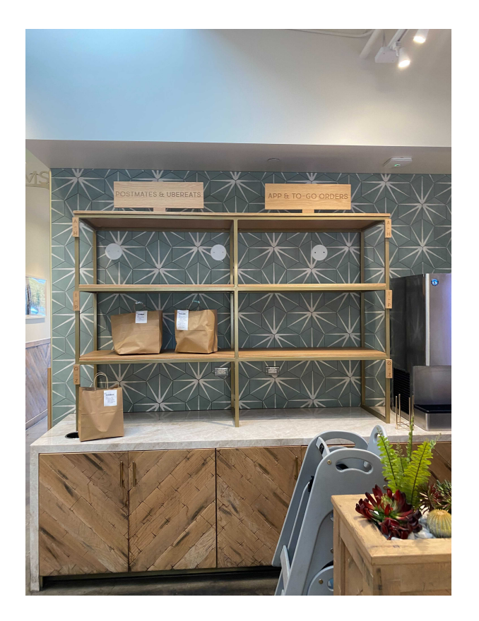
[Figure 11. Tocaya serves as a 'fine-casual' California inspired Mexican restaurant with locations surrounding Southern California and Arizona. Due to its popularity and influx of to-go orders, the image displays the two shelves: one for normal pick up and the other for delivery app partners, Postmates and UberEats. Photographed by the author in August 2021.]

[Figure 10.Located in Santa Monica, California, the window serves as pick up for a ghost kitchen. Third party delivery personnel and customers waiting for pick up tend the window as they wait for their order to be ready. Photographed by the author in July 2021.]