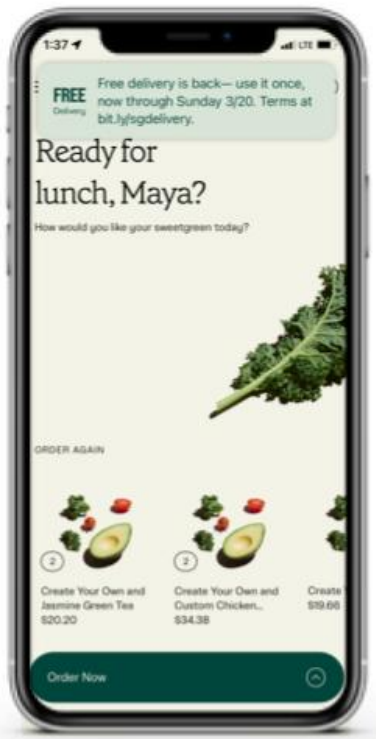
[Figure 13. Sweetgreen App welcome page customized to the customer. Past orders, name, and dietary restrictions are all noted. Additionally, free shipping code is features at the top.]