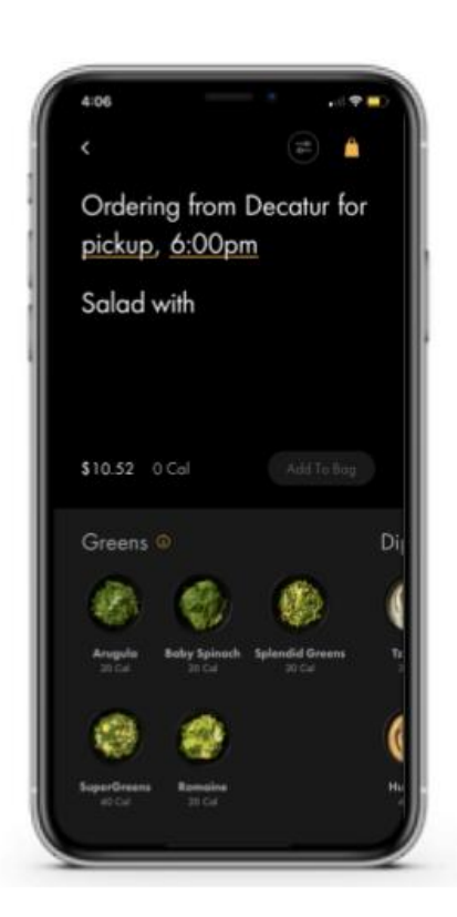
[Figure 14. Cava's ordering app showing customization and caloric value of items. Previous customization options are applicable as well as setting order pick up time or delivery. Screenshot collected by the author in 2022.]