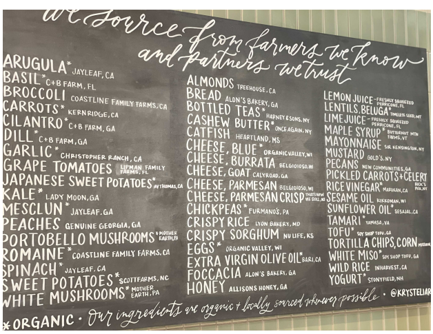
[Figure 9. Image of Sweetgreen sourcing from local farmers. The image was photographed at the Ponce City Market location.]