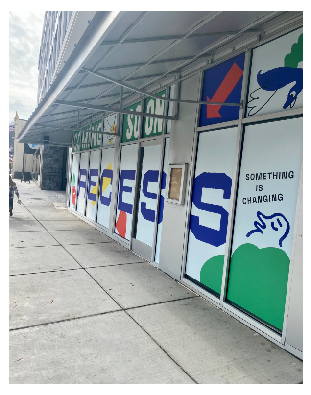
[Figure 3. Recess Buckhead. The outside graphic is situated for spectators to see when driving or walking on Roswell Road.]