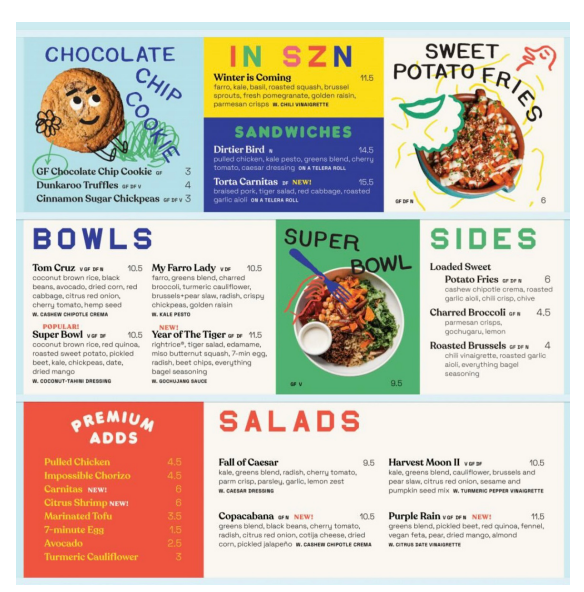
[Figure 5. Recess New Menu 2022. Downloaded by the author in February 2022.]