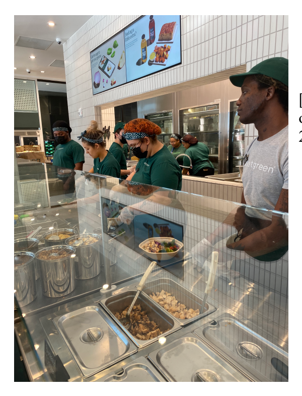
[Figure 7. Image of the line system captured during the opening of Sweetgreen West Midtown on March 18<sup>t</sup>, 2022.]