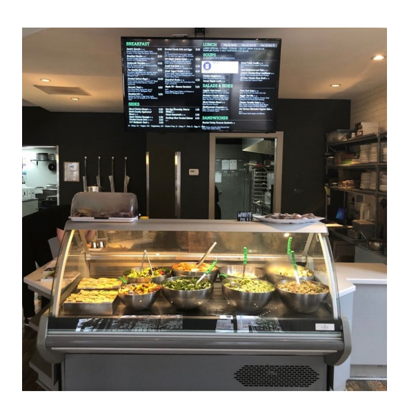
[Figure 6. MetroFresh Midtown case in 2021.]