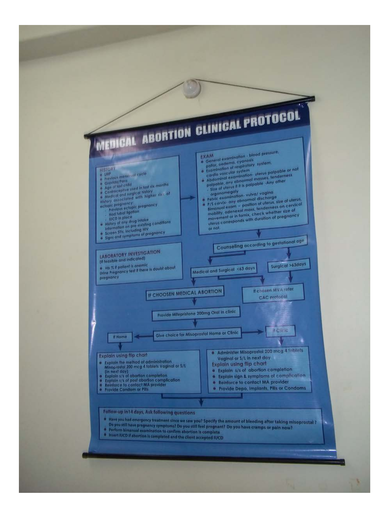
Counseling Materials: CAC Unit of the Paropakar Maternity and Women's Hospital, Kathmandu, Nepal.