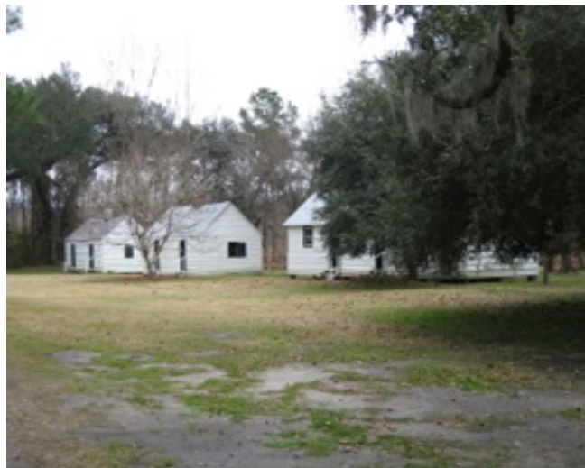
(Top, figure 14) Entrance sign to Magnolia Plantation & Garden, 2009. The “From Slavery to Freedom Tour” opened to the public this same year, and site producers nailed a new board to the bottom of old sign. (Bottom, figure 15) Cabins in “From Slavery to Freedom” tour, after restoration, 2009.