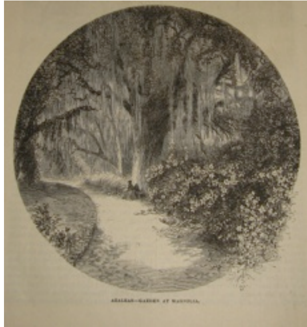
(Figure 1) Print of garden path at Magnolia Plantation from “Up the Ashley and Cooper,” Harper’s New Monthly Magazine , December 1875, courtesy of the College of Charleston Special Collections.