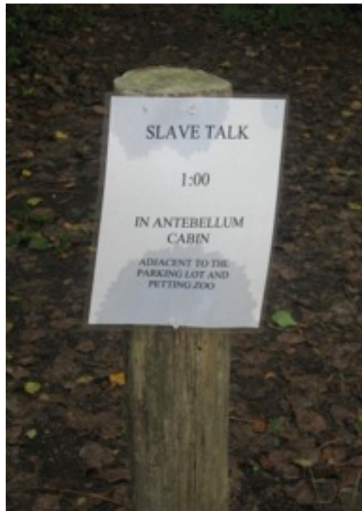
(Figure 12) “Slave Talk” sign, locate beside “Ante Bellum Cabin” (below) at Magnolia Plantation, 2007. This sign and tour were removed by 2009.