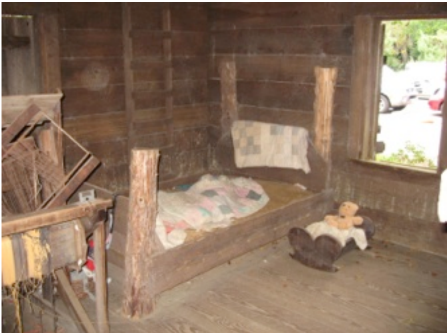
(Figure 13) Interior of “Ante Bellum Cabin,” at Magnolia Plantation, 2007. In the 1990s, Drayton Hastie furnished an outbuilding by the parking lot to look like his perception of the interior of an antebellum slave cabin.