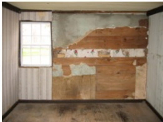
(Top left, figure 16) Former Cabin Project director, D.J. Tucker, presenting cabin restoration plan and historic lecture to tour group, 2009. (Middle, figure 17) tour participants explore cabins independently after listening to tour presentation, 2009. (Bottom, figure 18), interior of cabin in "From Slavery to Freedom" tour, 2011.