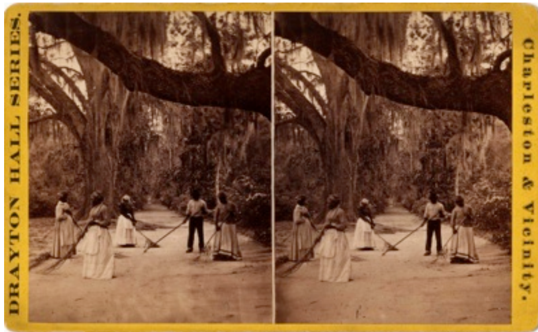
(Figure 2) Front of stereograph image of African Americans working at Magnolia Plantation, F.A. Nowell, photographer and publisher, ca. 1890s, courtesy of Drayton Hall, a historic site of the National Trust for Historic Preservation.