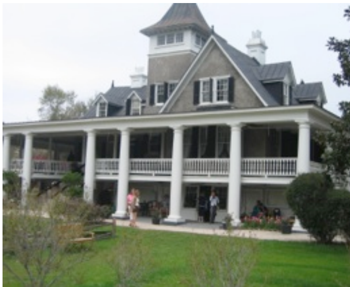
(Figure 7) Main house at Magnolia Plantation and Gardens, 2008. The current house was a hunting lodge that the family moved from Summerville, South Carolina to be the family residence after the antebellum home burned during the Civil War. In 1995, site director Drayton Hastie added a wrap around porch and columns.