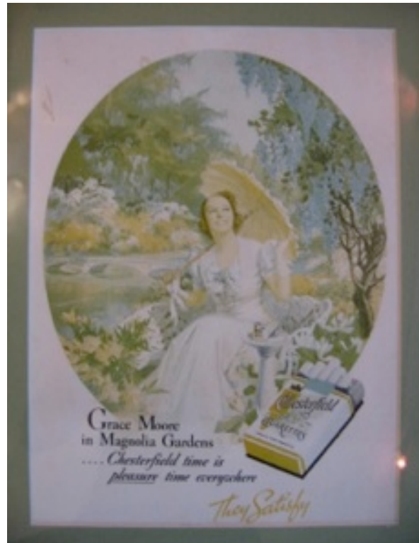
(Top, figure 3, and bottom, figure 4) Advertisements emphasizing garden beauty, leisure, and escape in Magnolia's Gardens, ca. 1950-60s (when Norwood Hastie was site director), courtesy of Magnolia Plantation & Gardens archives.