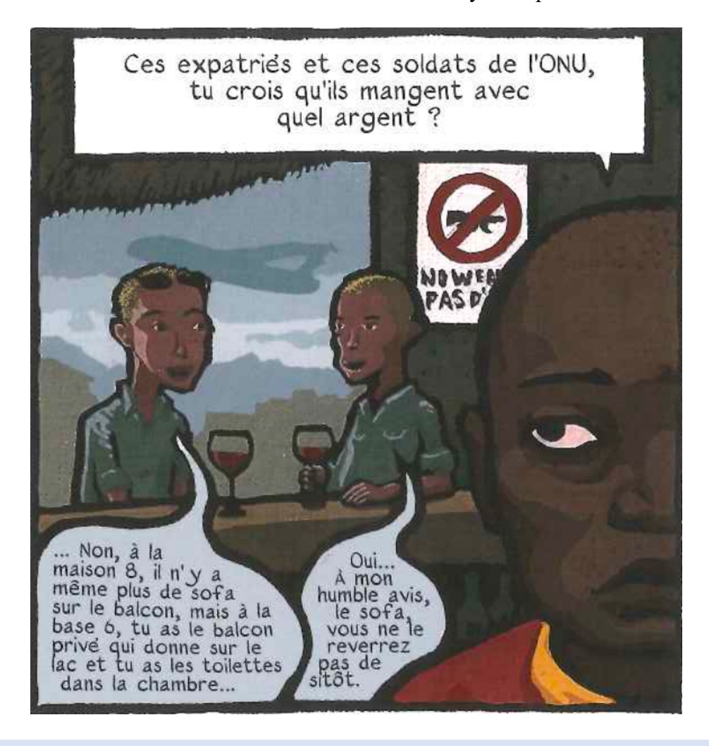
"...non à la maison 8, il n'a même plus de sofa sur le balcon, mais à la base 6, tu as le balcon privé qui donne sur le lac et tu as les toilettes dans la chambre...

peacekeepers, still dressed in their uniform and with sunglasses lazily sitting on their heads, as they sip on wine and converse about the accommodations they were provided with.