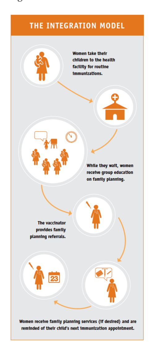
Figure 2. CARE's HIN NOU VIVO! Integrated FP/EPI Services Model<sup>67</sup>

20 (of 40) Ministry of Health facilities, serving 128,662 people living within the Adjohoun, Bonou, and Dangbo health zones in the Ouémé Department of southeast Benin. When mothers arrived at a health facility with their children for immunization, community health workers gave brief targeted messages about the benefits and availability of FP services at group education sessions before immunization. After these sessions, the women were offered referral cards for individual counseling with nurse midwives, where, according to the implementation model, they were able to receive their method of choice on the same day and at the same health facility. A diagram of the integration model used may be found in Figure 2 .