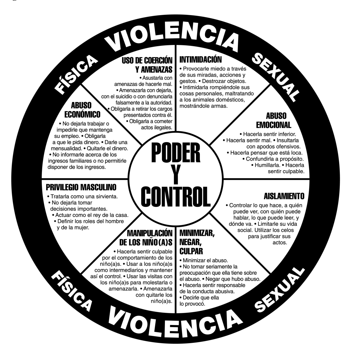
Figure 4: The Power and Control Wheel