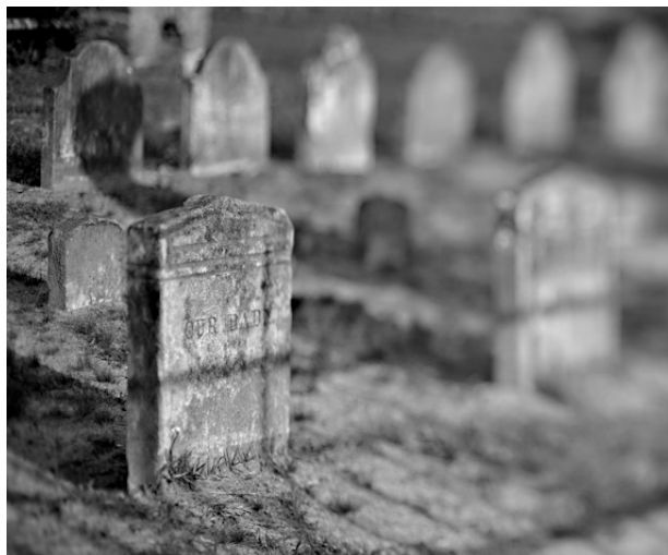
Figure 1-"Our Baby"