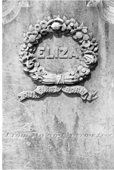
Figure 6- "Our First Born."