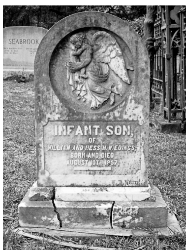
Figure 5- "Infant Son" Carried to Heaven by an Angel