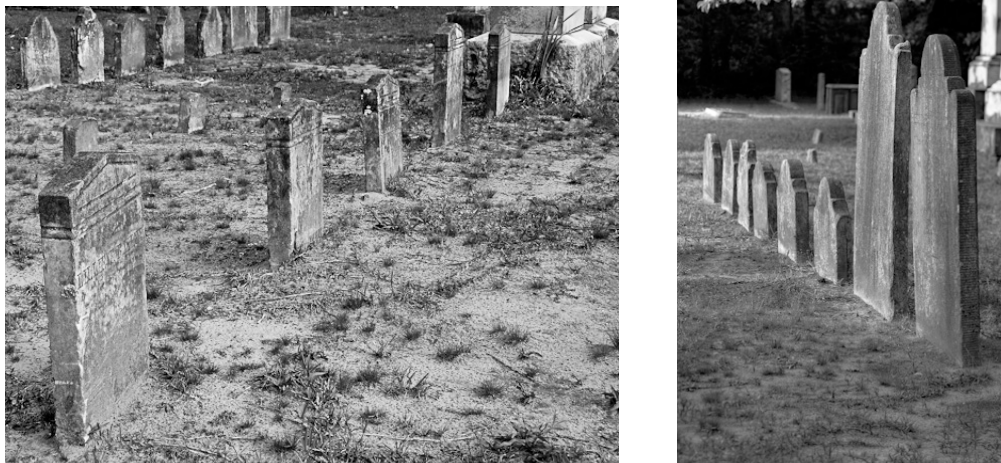
Figure 9- Family Burial Plots in Presbyterian Church Cemetery, Edisto Island, SC