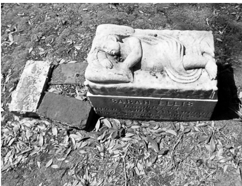
Figure 4- Sarah Ellis's Headstone with a Sleeping Angel.