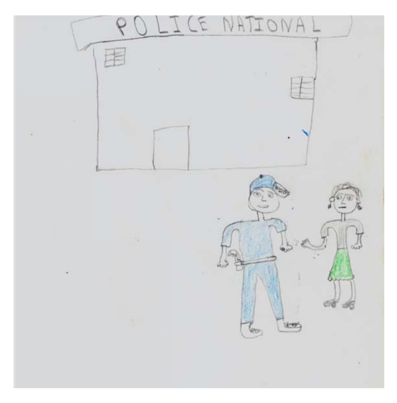
Image 9: A 17-year-old female participant drew herself in the future, speaking to police officers to explain to them that rape is not a good thing.

Another common cultural theme was a general lack of knowledge and understanding of rape, and more generally of sexuality, among people in Burkina Faso. As discussed above, two male participants were emotionally moved and educated about what rape is like from their viewing of Essie . Three participants advocated for counseling various groups on the effects of rape, thinking that rapists, the police, and young people in general are not aware of these effects. A 24-year-old female would like to counsel rapists "on the effects of rape. Because, in raping girls, that can seriously play with their psychology. Without the rapist knowing." In her third drawing (Image 9), a 17-year-old female drew a picture of herself and a policeman, explaining that in the picture "I have gone to the police to try to explain to them that rape is not a good thing. And they can make more of an effort to stop this type...of crime." A male university student felt that children need to be counseled. He drew an old man, a lawyer, teaching children about sexuality, bad behaviors,