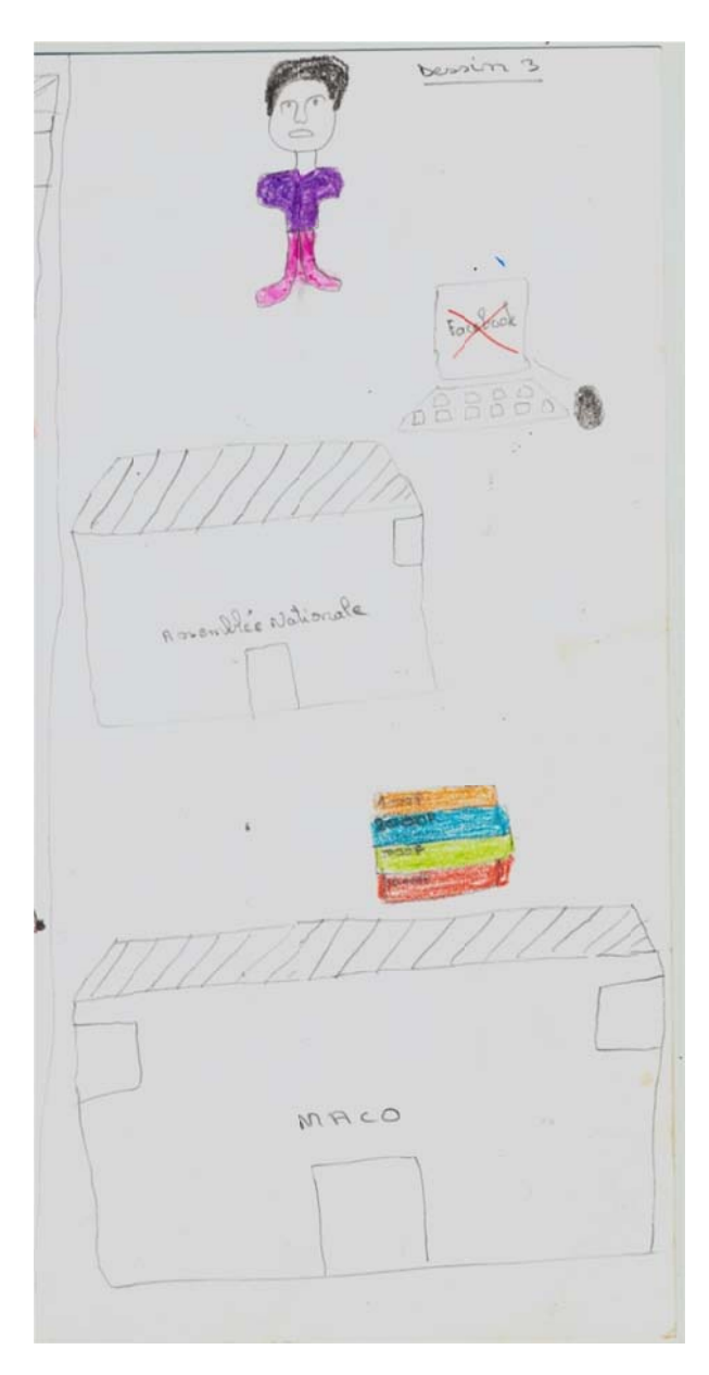
Image 8: A 17-year-old female drew what she would like to see done in the future to reduce rapes: suppression of Facebook, laws passed by the Assemblée Nationale to punish rapists, and fines and prison time for rapists.

elaborated that she believed that the law was not applied, and that this made rapists bold as they knew that they would not be punished. In addition to concern about lack of policemen and weakness of laws punishing rapists, multiple participants explained that even if police were present, they may not enforce the laws because "even if they find the delinquents, [they] let themselves be corrupted by them" (female, age 17).