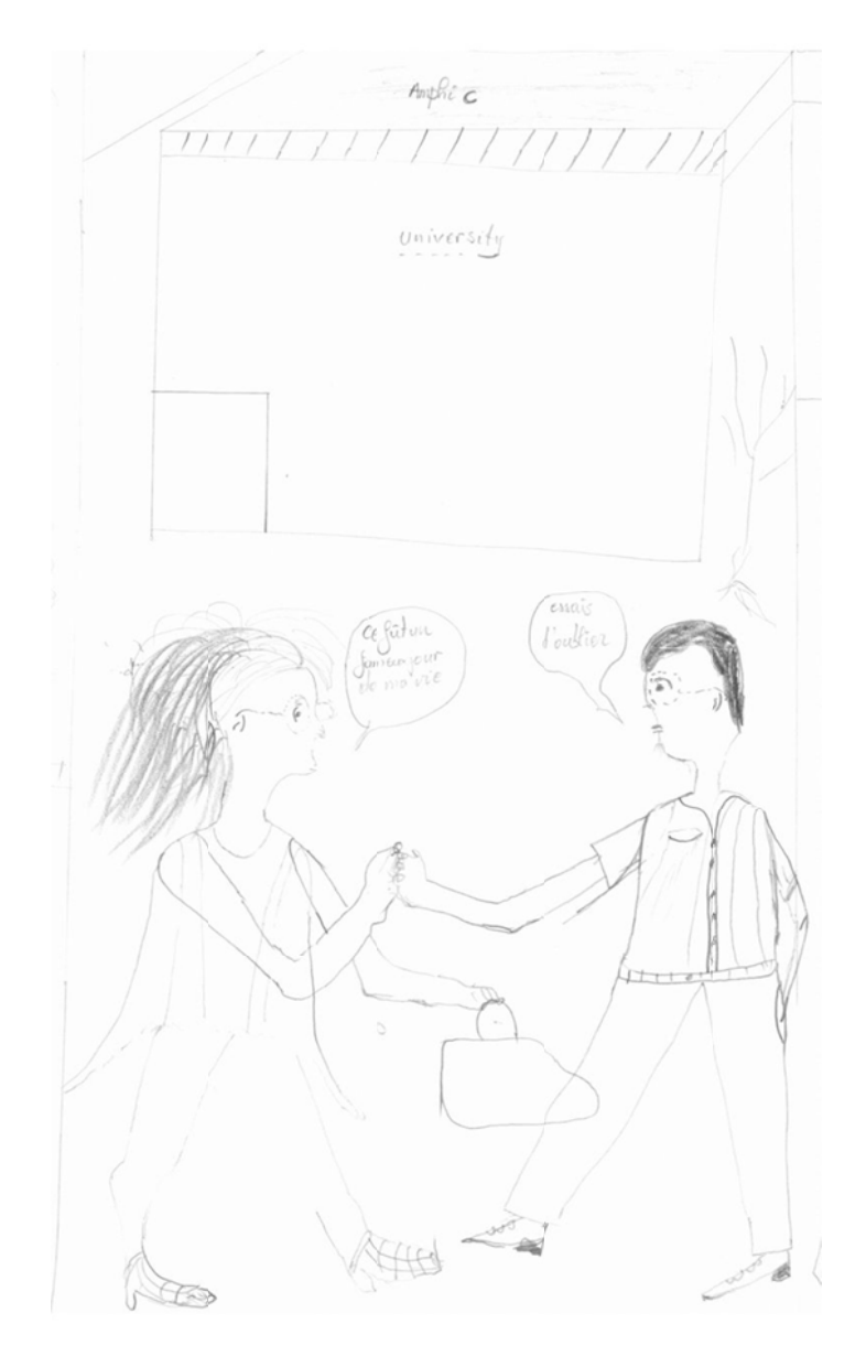
Image 1: Male university student drew a female friend of his who was raped at the age of 6. She says "that was an infamous day in my life," and he responds "try to forget."

Another male participant was led to a greater understanding of the situation of a woman in his village by watching the film. She was one of a number of women who had been raped in the remote area surrounding his village by an HIV positive man, and when she was found to be HIV positive she was abandoned by her husband. He described her in his drawing (Image 2) as