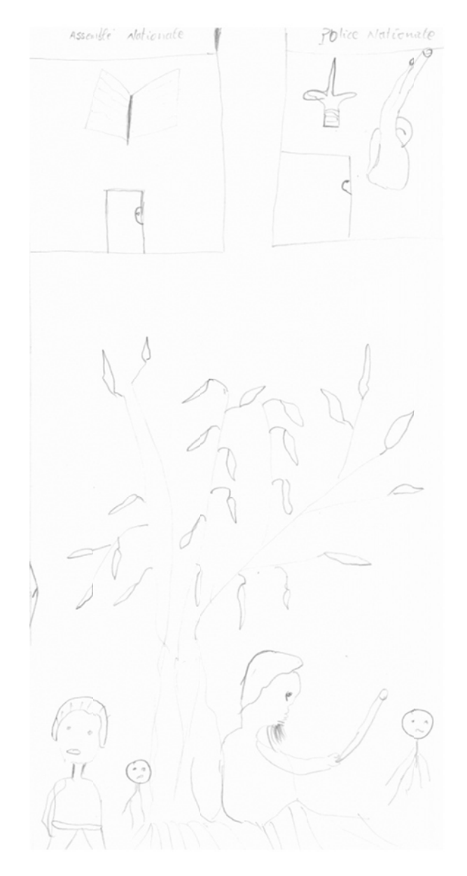
Image 10: A male university student drew three important changes that he hopes to see in the future: stricter laws about rape in the Assemblée Nationale, more security from the police, and education of children. Educating the children is an old man, a lawyer, who teaches them about sexuality, bad behaviors, and rape.

These observations vary based on gender. First of all, more women (nine) commented on cultural issues in Burkina than men (five). Of the male participants who discussed cultural issues, one out of five was concerned about the need for more legal or police protection for women. Among the women, five of nine commented on this need.