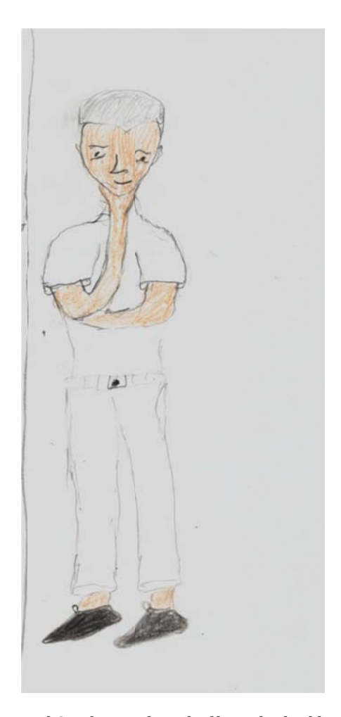
Image 6: Male participant, aged 27, drew a friend of his who had been raped and found to be HIV positive. He shows the victim disheartened and not knowing what to do. (In the interview, the participant originally states that this is a male, but later states that it is a female friend of his).

because that permits one to avoid disease, above all, and also unwanted pregnancy. And, they showed through this film also, that the authorities punish people like that. So, people in this situation shouldn't worry, they are in good hands. (Female, high school student)