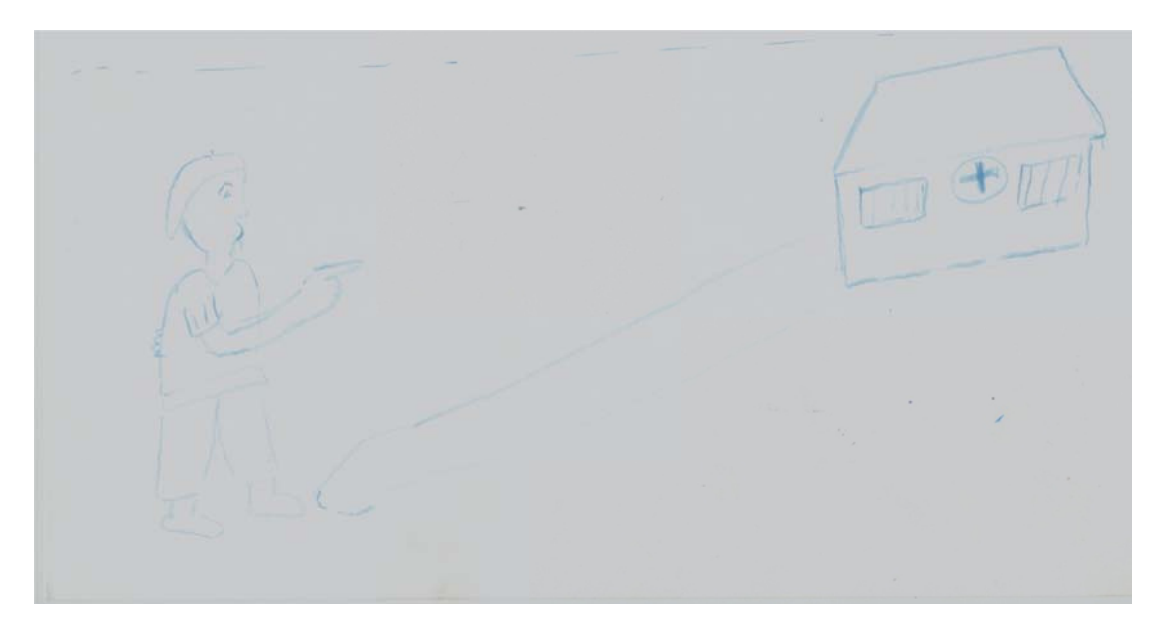
Images 2 (top) and 3 (bottom): Male 20-year-old high school student drew a woman in his village (Image 2) who had been raped by an HIV-positive man, found to be HIV-positive, and abandoned by her husband and family. In Image 3, he draws his plans for the future, to go to the hospital to learn all that he can about health topics, particularly HIV, and teach the people in his village about these topics when he goes there during his school vacations.

In total, five female participants and three male participants discussed messages in the films as important to people in their lives. The male participants talked about this in a much deeper way. Girls who talked about a family member or friend reported that they