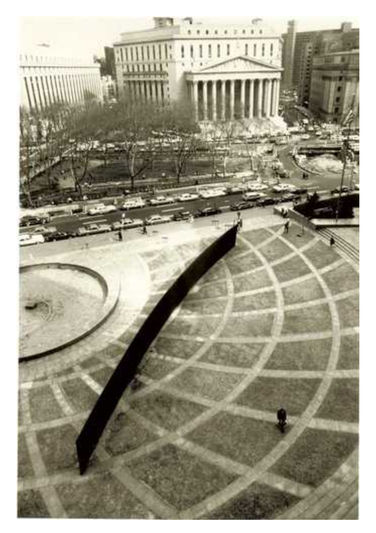
Figure 11 Richard Serra, Tilted Arc, 1981-89, Foley Federal Plaza, New York. <u>https://www.tate.org.uk/art/artists/richard-serra-1923/lost-art-richard-serra</u>. Removed in 1989.