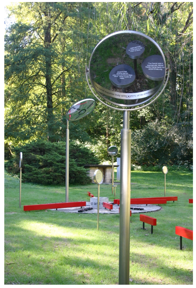
Figure 3 Mary Miss, Streamlines: Indianapolis/ City as Living Lab (I/CaLL), 2015, The White River, Indianapolis, Indiana. <u>https://marymiss.com/projects/streamlines-indianapolis-city-as-living-lab-icall/</u>. Installations at Pogues Run, Holy Cross at Vermont street, Indianapolis, Indiana, is still active.