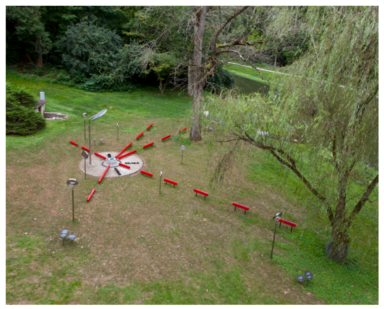
Figure 2 Mary Miss, Streamlines: Indianapolis/ City as Living Lab (I/CaLL), 2015, The White River, Indianapolis, Indiana. <u>https://marymiss.com/projects/streamlines-indianapolis-city-as-living-lab-icall/</u>. Installations at Pogues Run, Holy Cross at Vermont street, Indianapolis, Indiana, is still active.