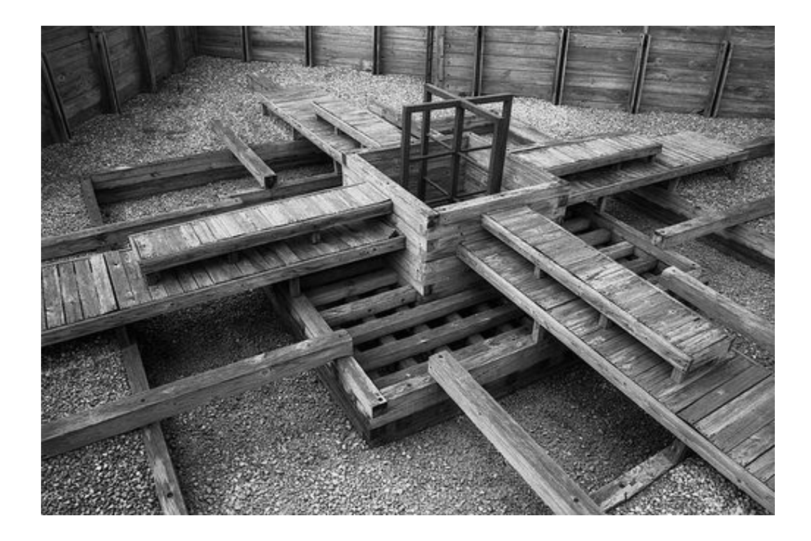
Figure 8 Mary Miss, Field Rotation, 1980-81, Governors State University, Illinois. <u>https://marymiss.com/projects/field-rotation/</u>. <i>Installation is still active.