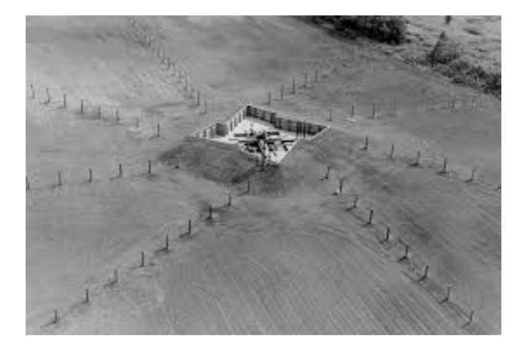
Figure 9 Mary Miss, Field Rotation, 1980-81, Governors State University, Illinois. Installation is still active.