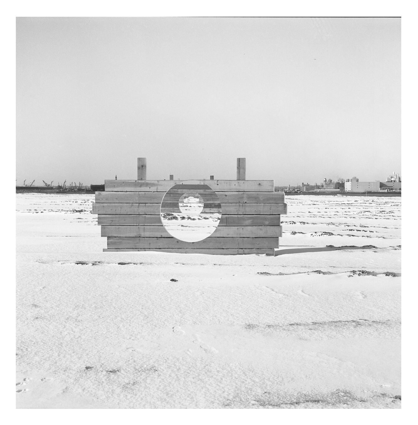
Figure 1 Mary Miss, Battery Park Landfill, 1973, Battery Park City Landfill, New York. <u>https://marymiss.com/projects/battery-park-landfill/</u>. No longer extant.