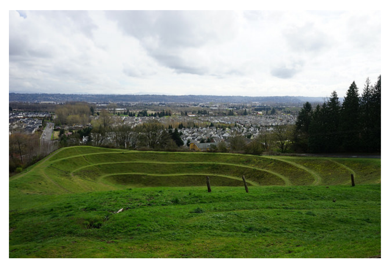
Figure 10 Robert Morris, Earthwork Johnson Pit #30, Washington. <u>https://preservewa.org/most_endangered/robert-morris-</u><u>earthwork/</u>. Installation is still active.