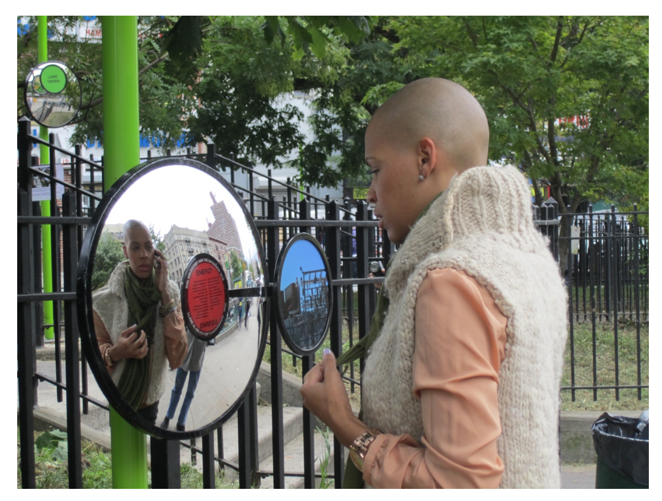
Figure 15 Mary Miss/City as a Living Laboratory, Broadway: 1000 Steps, 2009-ongoing, Broadway, New York. <u>https://marymiss.com/projects/broadway-1000-steps/</u>. Temporary Pilot Hub.