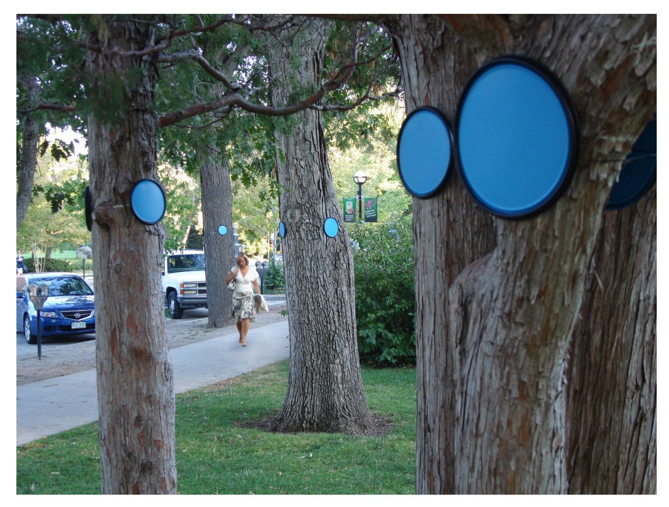
Figure 14 Mary Miss, Connect the Dots, 2007, Boulder, Colorado. <u>https://marymiss.com/projects/connect-the-dots/</u>. No Longer Extant.