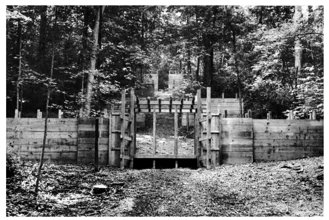
Figure 6 Mary Miss, Staged Gates, 1979, Dayton Ohio. <u>https://marymiss.com/projects/staged-gates/</u>. Installation is still active.