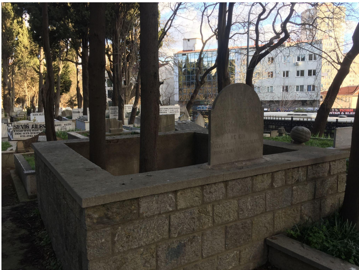
Fig. 5: Nadir Ağa's grave at İçerenköy Cemetery, January 2022

As my research progressed, the characters I explored—Nadir Ağa, Tahsin Nejat Bey—stopped solely being part of some past that took shape only in my imagination. They were people physically embedded in the former imperial capital of Istanbul, in which I lived. Nadir Ağa's neighborhood Göztepe and Erenköy where Tahsin Nejat Bey worked are both places very close to my home on Istanbul's Anatolian side. Each time the train I was riding on passed through Göztepe Station, it was the specter of Nadir Ağa, sitting on the same bench, watching me instead of me going through the images, writings, and the impressions he left behind. Living very close to them, I wanted to get a hold of the material traces of their lives. Nadir Ağa's house seems to have fallen into disrepair and been demolished, and I could not locate Tahsin Nejat Bey's house.