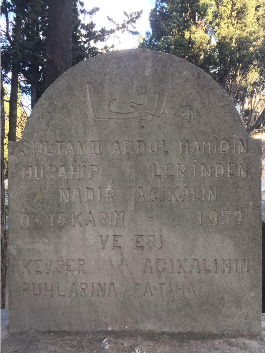
Fig. 4: Nadir Ağa's headstone at İçerenköy Cemetery, January 2022