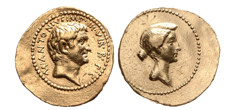
Figure 11. Gold aureus of Marcus Antonius ( RRC 527), ca. 39-38 B.C.E., moving mint, 8.01 g, 22 mm, Münzkabinett der Staatlichen Museen zu Berlin, 18202297, coin reproduced 2:1 (courtesy Münzkabinett - Staatliche Museen zu Berlin, CC BY-NC-SA 3.0 DE: https://creativecommons.org/licenses/by-nc-sa/3.0/de/deed.en).