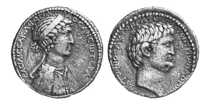
Figure 17. Silver tetradrachm of Kleopatra (VII) depicting Marcus Antonius on the reverse, ca. 36 B.C.E., Antioch-on-the-Orontes (uncertain), 14.72 g, 28 mm, Münzkabinett der Staatlichen Museen zu Berlin, 18204040, coin reproduced 1.5:1.