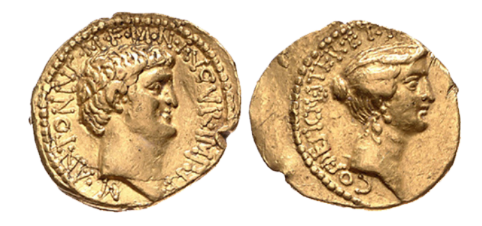
Figure 12. Gold aureus of Marcus Antonius (RRC 533/3), ca. 39-38 B.C.E., moving mint, 8.08 g, 20 mm, Münzkabinett der Staatlichen Museen zu Berlin, 18215843, coin reproduced 2:1.