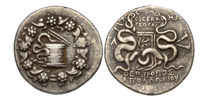
Figure 9. Silver cistophorus of the proconsul M. Tulius Cicero, 51-50 B.C.E., Apameia, 11.81 g, 26 mm, Münzkabinett der Staatlichen Museen zu Berlin, 18204062, coin reproduced 1.5:1 (courtesy Münzkabinett - Staatliche Museen zu Berlin, CC BY-NC-SA 3.0 DE: https://creativecommons.org/licenses/by-nc-sa/3.0/de/deed.en).