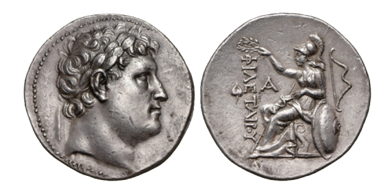
Figure 14. Silver tetradrachm of Attalos (I) Sōtēr depicting Philetairos, 241-197 B.C.E., Pergamon, 17.03 g, 32 mm, Münzkabinett der Staatlichen Museen zu Berlin, 18203102, coin reproduced 1:1 (courtesy Münzkabinett - Staatliche Museen zu Berlin, CC BY-NC-SA 3.0 DE: https://creativecommons.org/licenses/by-nc-sa/3.0/de/deed.en).