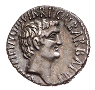
Figure 13. Silver denarius of M. Barbatius Pollio depicting Marcus Antonius ( RRC 517/2), 41 B.C.E., moving mint, 3.98 g, 18 mm, Münzkabinett der Staatlichen Museen zu Berlin, 18215792, coin reproduced 2:1 (courtesy Münzkabinett - Staatliche Museen zu Berlin, CC BY-NC-SA 3.0 DE: https://creativecommons.org/licenses/by-nc-sa/3.0/de/deed.en).

Figure 12. Gold aureus of Marcus Antonius (RRC 533/3), ca. 39-38 B.C.E., moving mint, 8.08 g, 20 mm, Münzkabinett der Staatlichen Museen zu Berlin, 18215843, coin reproduced 2:1 (courtesy Münzkabinett - Staatliche Museen zu Berlin, CC BY-NC-SA 3.0 DE: https://creativecommons.org/licenses/by-nc-sa/3.0/de/deed.en).