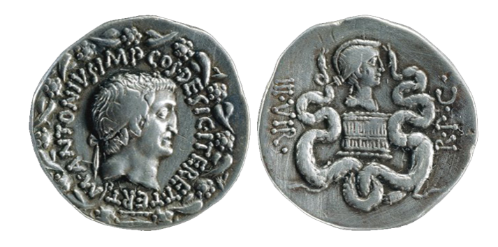
Figure 15. Silver cistophorus of Marcus Antonius ( RPC 2201), ca. 39/8 B.C.E., Ephesos (uncertain), 12.24 g, British Museum, G.2204, coin reproduced 2:1.