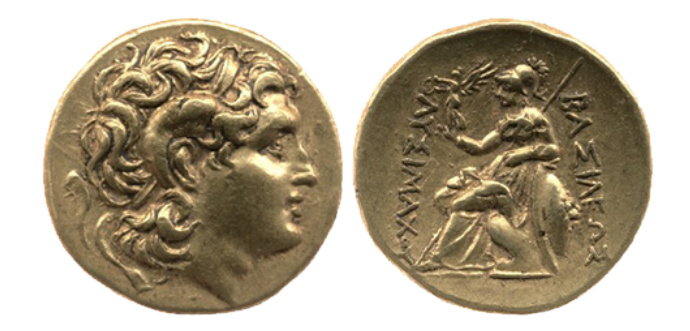
Figure 5. Gold stater of Lysimachos depicting Alexander III, ca. 260-190 B.C.E., Thrace, 8.48 g, British Museum, 1928,0608.36, coin reproduced 2:1.