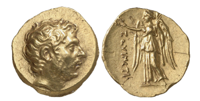
Figure 4. Gold stater of T. Quinctius Flamininus, ca. 196 B.C.E., Greece, 8.53 g, 20 mm, Münzkabinett der Staatlichen Museen zu Berlin, 18201660, coin reproduced 2:1 (courtesy Münzkabinett - Staatliche Museen zu Berlin, CC BY-NC-SA 3.0 DE: https://creativecommons.org/licenses/by-nc-sa/3.0/de/deed.en).

Figure 3. Silver cistophorus of Marcus Antonius ( RPC 2202), ca. 39/8 B.C.E., Ephesos (uncertain), 11.57 g, 25 mm, Münzkabinett der Staatlichen Museen zu Berlin, 18213381, coin reproduced 2:1 (courtesy Münzkabinett - Staatliche Museen zu Berlin, CC BY-NC-SA 3.0 DE: https://creativecommons.org/licenses/by-nc-sa/3.0/de/deed.en).