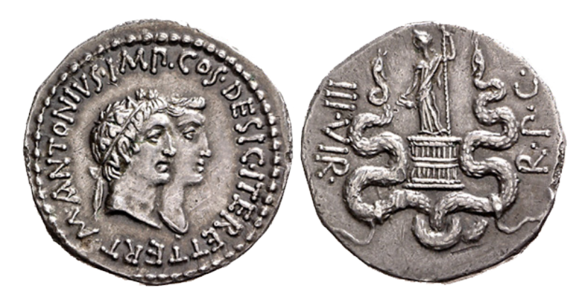
Figure 3. Silver cistophorus of Marcus Antonius ( RPC 2202), ca. 39/8 B.C.E., Ephesos (uncertain), 11.57 g, 25 mm, Münzkabinett der Staatlichen Museen zu Berlin, 18213381, coin reproduced 2:1 (courtesy Münzkabinett - Staatliche Museen zu Berlin, CC BY-NC-SA 3.0 DE: https://creativecommons.org/licenses/by-nc-sa/3.0/de/deed.en).