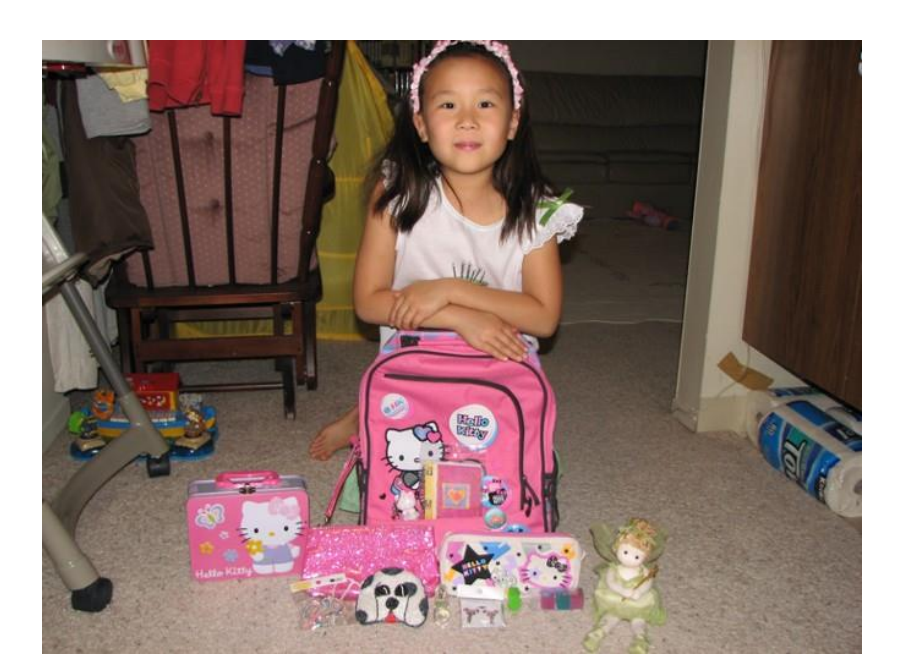
Figure 2. The author on her fifth birthday.

would appear within and outside of her work. Since kawaii has also increased in popularity in America and American cuteness is heavily associated with Japanese cuteness for Asian Americans, Korean American women (who are part of both Korean and American spheres) are even more likely to have kawaii -influenced impressions of cuteness. However, as touched on, given the fraught history between Japan and Korea, it is possible for Korean American women to experience ambivalence regarding any direct imperial aspects or the generally kawaii -inspired cuteness of a book like Crying in H Mart or Korean television show like Pucca .<sup>37</sup> Notwithstanding generational or cultural distance, knowledge of a history that evidences the pain and trauma of one's ancestors elicits complicated feelings, and present observation of a lack of historical acknowledgement can evoke further questioning of whether Japan has and continues to gloss over an afflicting past through the positive veil of cuteness, as well as what this implies for Korean American women as a group.