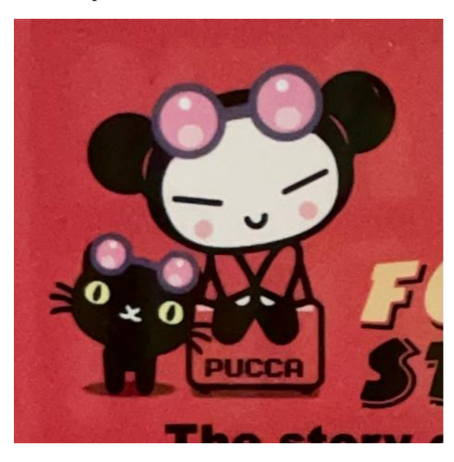
Figure 5. A close-up view of the smaller Pucca found in the upper left side of the clock. Personal photo.

Upon revisiting the Pucca of my childhood, I realized that my impartial and even positive thoughts toward her had shifted. I now view her and several other characters' lines for eyes as something greater, as directly mirroring racist Asian caricatures of particularly the 19th century, during which "yellow peril" reached new heights and white Americans and Westerners feared "Chinese [and Asian] immigrants as potential threats to national security," "degrad[ing] workplaces and neighborhoods," and "threaten[ing] the stability of the entire social system." Pucca herself is not a product of this period—she was created as an "animated online E-card service" in 2000 by the South Korean company VOOZ Character System, which became the basis for her animated television series of the same name in the mid-2000s. Expanding Westward, in 2004, the E-card was licensed by Jetix Europe, which acquired television rights