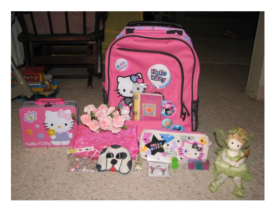
Figure 3. Several Hello Kitty goods received as gifts for the author's fifth birthday. Personal photo.