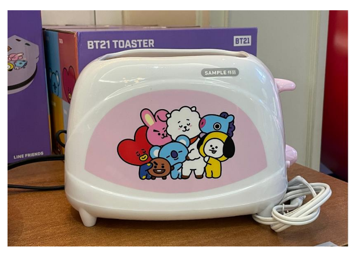
Figure 1. The BT21 characters as seen on a toaster at the Line Friends New York Times Square Store. Personal photo.

has been developed by the Korean character series Line Friends in collaboration with BTS (Figure 1). The characters, with their large heads and simplistic features, are reminiscent of Hello Kitty and her kawaii image. To reiterate, if part of Japan's soft power is its cuteness, or kawaii , and Japan continues to hold some level of cultural and social influence over Korea through its soft power, it is likely that Korea and its cuteness have been shaped by the kawaii aesthetic. Thus, such characters as in BT21 and many other cute objects of or pertaining to Korea (such as the main object of my study, Crying in H Mart ) are likely to take inspiration from kawaii , which Japanese people view as those things that evoke particular emotions related to nurture; i.e., as an affective concept.<sup>35</sup>