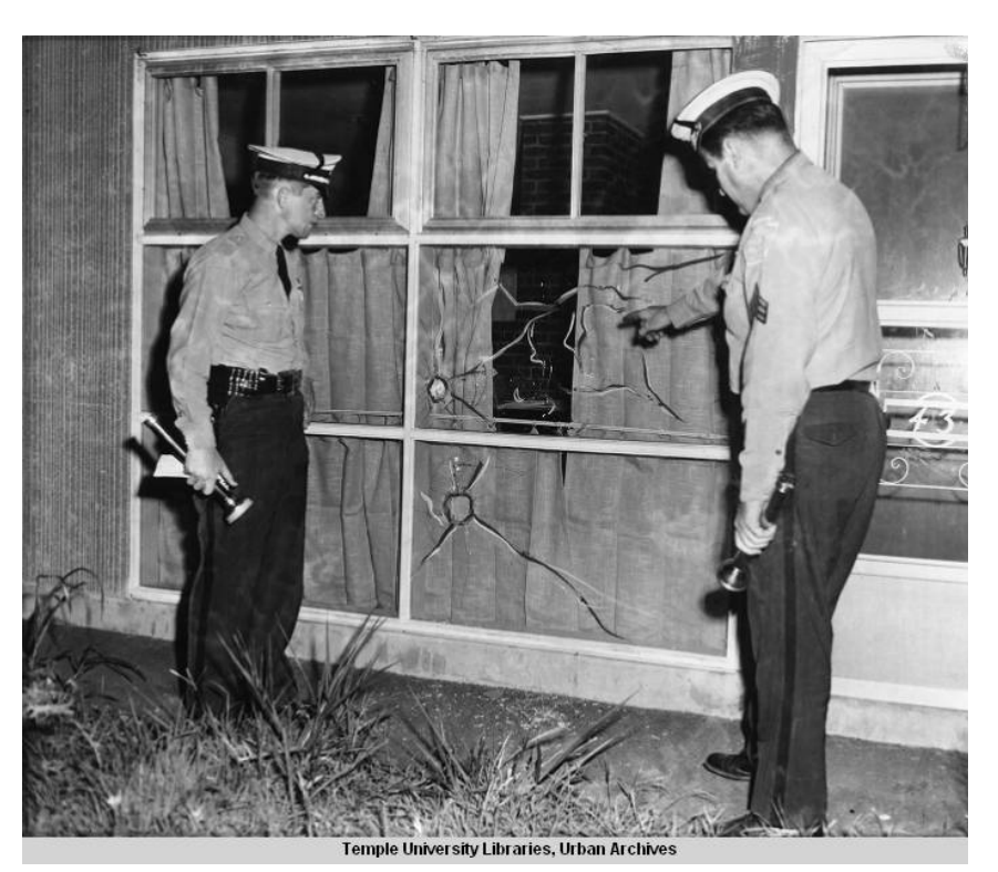
Two police officers examine the damage done to the Myers house after members of the mob threw stones on the night of August 13, 1957.